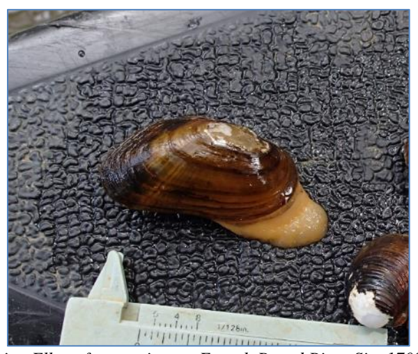
Appalachian Elktoe from mainstem French Broad River Site 170801.2ted

Buncombe and Henderson Counties, North Carolina