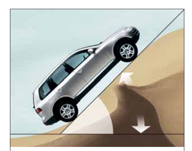
05. Climbing capability: 45 degrees The Touareg can handle extreme inclines allowing you access to places you've never ventured before.

04. Side slope angle: 35 degrees Even driving at angles up to 35 degrees the Touareg retains traction. This allows reversing and turning on steep inclines.