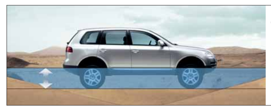
03. Wading depth: 580mm Even at depths of 580mm the engine and interior are protected from water.On models without air suspension, the wading depth is 500mm.