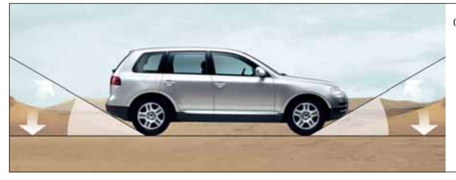
01. Approach and departure angles 28 degrees The height of the bumper has exceptional clearance allowing steep angles to be easily overcome. With air suspension the clearance increases to 33.2 degrees front and 33.6 degrees rear.

02. Breakover angle: 27 degrees Thanks to the high ramp angle, the Touareg is an accomplished off-roader on the most uneven surfaces. On models without air suspension, the ramp angle is 22.1 degrees.