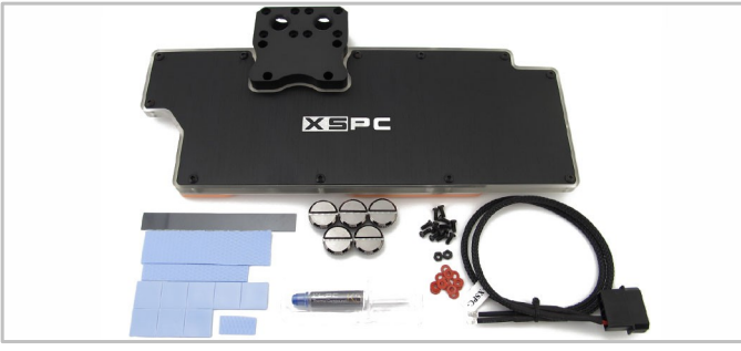
1. The waterblock is designed for SLI setups, so you can fit the G1/4" fittings to multiple sides of the block. Decide which configuration is best for your system.

Note: This waterblock is only suitable for reference design GTX 1080 cards. If you are unsure if your card if a reference design card, contact us prior to installation to make sure.