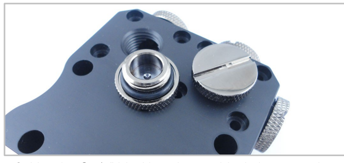
2. Use the G1/4" blanking plugs to block the unused ports.