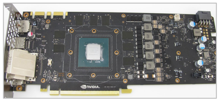
9. Clean the thermal paste from the GPU core and remove any residue left from the thermal pads.

7. Remove the backplate and remove the 14 bolts highlighted above.