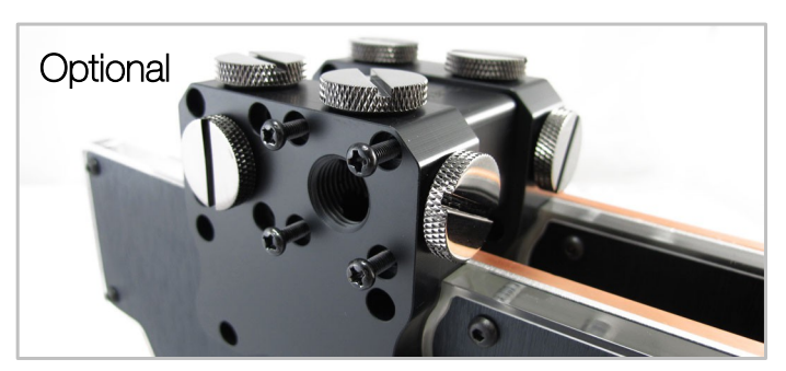
If you are using cards in crossflow you can use the optional SLI flow connector to bridge the two cards. This should be done after step 12.

4 . The block is now ready to be connected to the other watercooling components for leak testing.