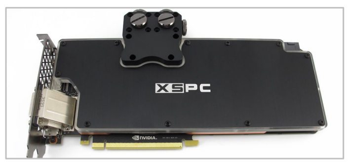
13 . Do not over tighten the screws as this may bend the card and cause permanent damage. The card is now ready for use. When you first boot it is advisable to use software to check the core temperature. If the temperature is high you will need to remount the block.