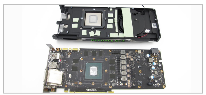
8. Turn the card back over and carefully remove the heat sink and fan. Now the card and heat sink are separated detach the fan power cable from the fan header.

6. Turn the card on its back and remove the 22 screws highlighted above.