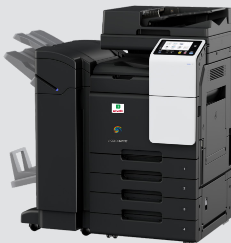
With FS-539SD and PC-218