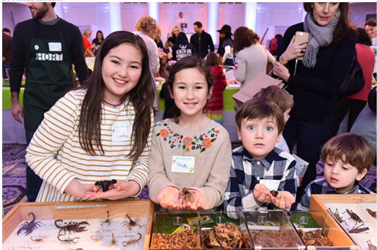
Little Explorers at Green Bean Bash