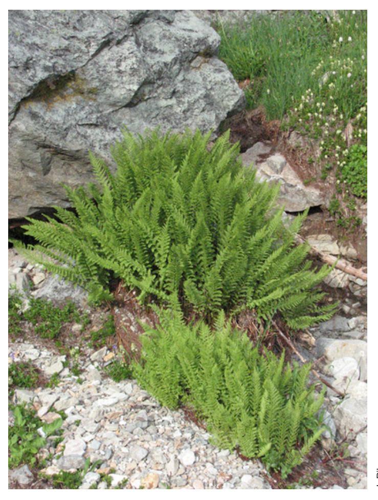
American Alpine Lady Fern (Athyrium alpestre)