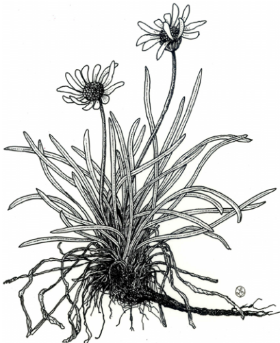
Illustration L. Mennell - YG