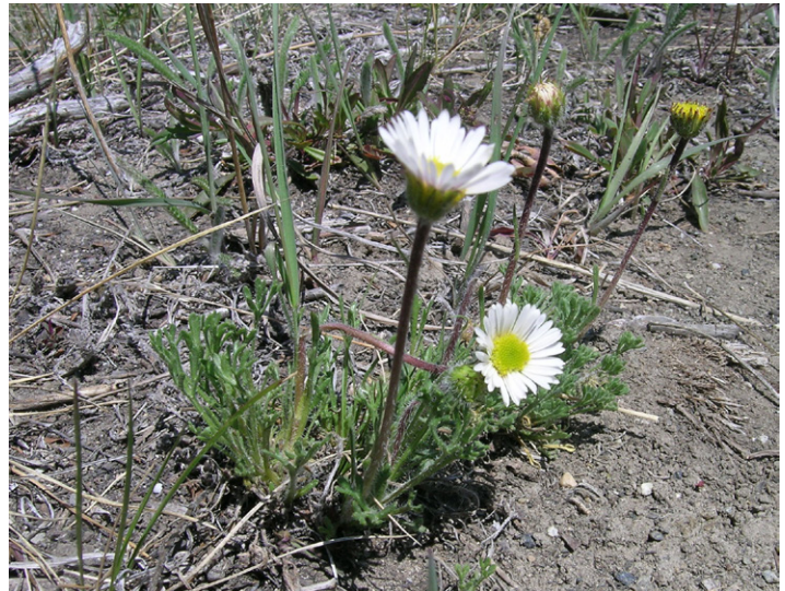
Cut-leafed Fleabane ( Erigeron compositus ) *see distinguishing features.