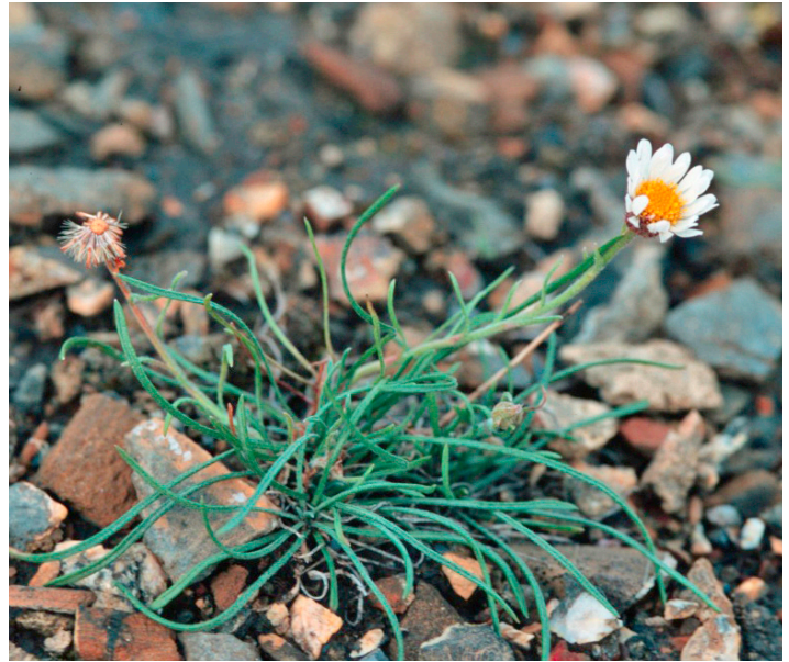
Buff Fleabane, Erigeron ochroleucus

Distinguishing features: Resembles Cut-leaf Fleabane, E. compositus , by having linear leaves that are much narrower than those of the Tufted Fleabane, E. caespitosus . Tufted Fleabane also has a flowering base (caudice) that is branched, and is usually unbranched in Buff Fleabane.