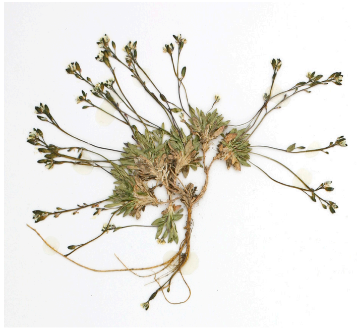
Canada Dept. of Agriculture

Distinguishing features: White flowers, stem hairless, leafless (or 1 leaf), fruits hairless <8 mm long. Draba lonchocarpa , a more common species, has fruits usually greater than 8 mm.