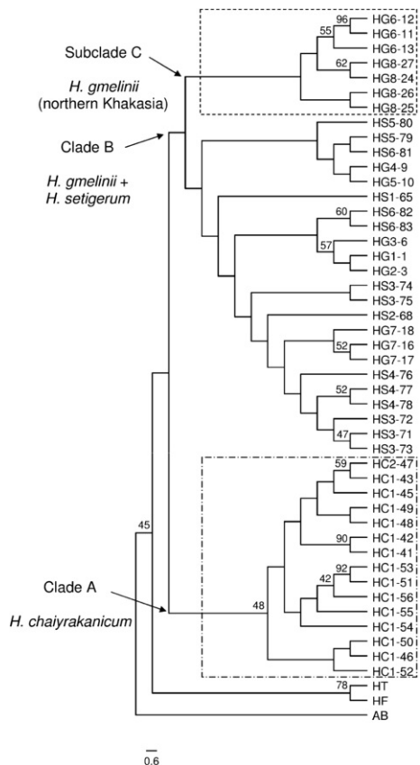
Fig. 3 Neighbor-joining tree based on Li & Nei genetic distances obtained from ISSR marker analysis from the studied H. gmelinii , H. setigerum and H. chaiyrakanicum samples. Outgroup samples of Hedysarum theinum , H. fruticosum and Astragalus bifidus were used to root the tree. Bootstrap support values greater than 40% are indicated on branches.

two optimal genetic groups, which separate the H. chaiyrakanicum individuals from the individuals of H. gmelinii and H. setigerum . An AMOVA analysis showed that 13.9% of the total gene diversity was found among the natural populations, whereas the remaining 86.2% of the total variation occurred within the populations (Table S2).