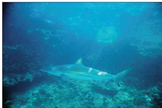
Fig. 2: Spinner shark, C. brevipinna , sighted in Gökova Bay, in August 1998.