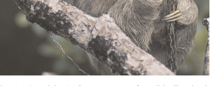
Fig. 1. —An adult Bradypus pygmaeus from Isla Escudo de Veraguas.

as extant two-toed sloths ( Choloepus ) based on craniodental characters (Gaudin 2004). This generic synonymy is modified from Gardner (2007). The following key to the 4 species of Bradypus is from Wetzel (1985) with modifications from Anderson and Handley (2001):