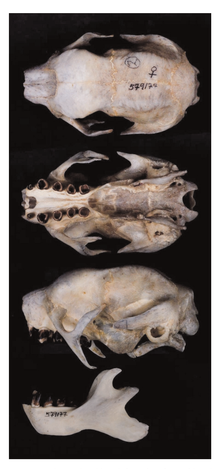
Fig. 2. —Dorsal, ventral, and lateral views of cranium and lateral view of mandible of an adult female Bradypus pygmaeus (United States National Museum 579177; age class 2 of Anderson and Handley [2001]). Greatest length of cranium is 68.7 mm.