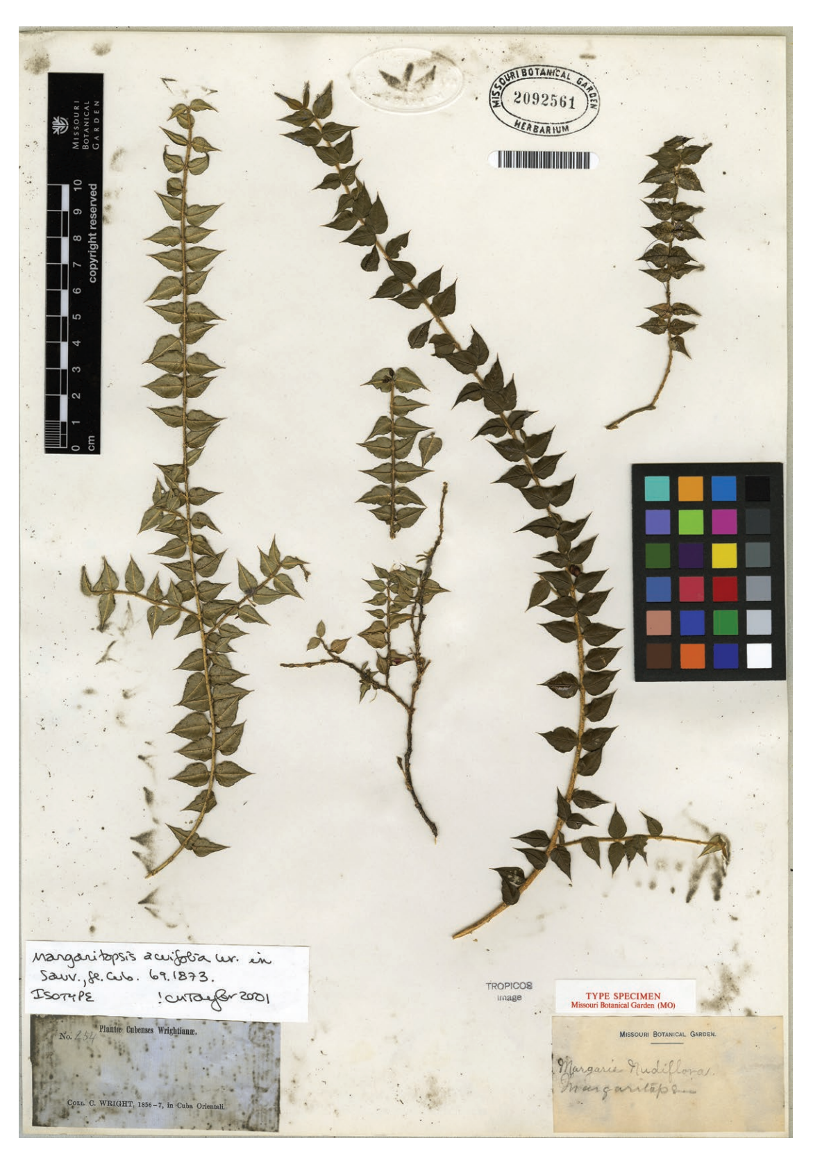
Fig. 2. – Isotype of Eumachia acuifolia (C. Wright) Delprete & J.H. Kirkbr.