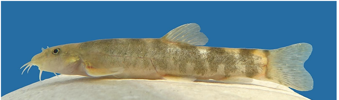
Figure 4. Paraschistura ilamensis , VMFC PSI3-P, paratype; 41 mm SL; Iran: spring Siahgav.