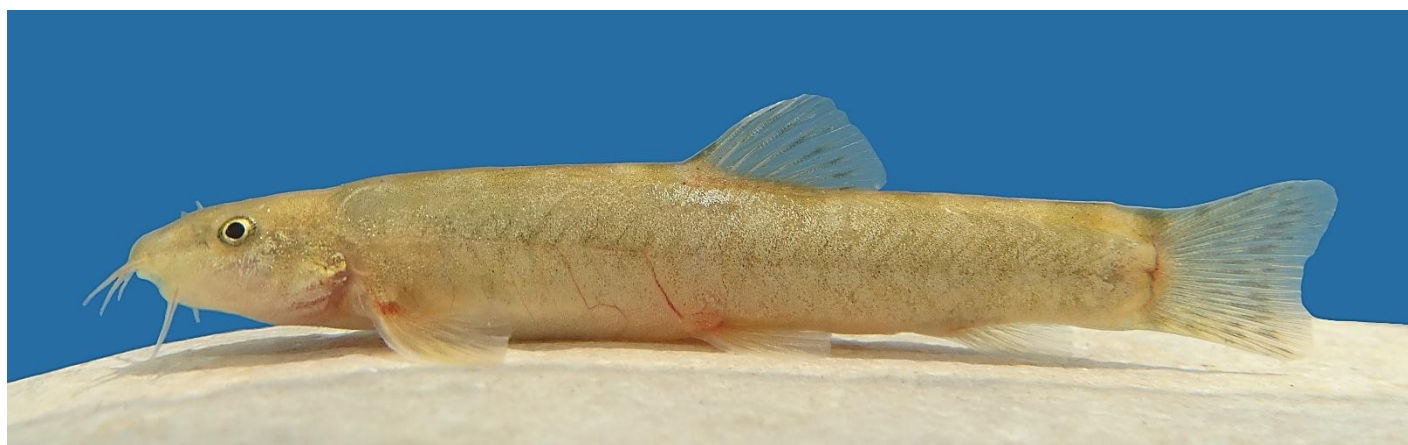
Figure 5. Paraschistura ilamensis , VMFC PSI3-P, paratype; 39 mm SL; Iran: spring Siahgav.