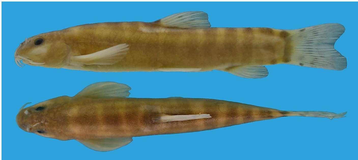
Figure 1. Paraschistura ilamensis , VMFC PSI3-H, holotype, 43 mm SL; Iran: spring Siahgav.

in 5% buffered formaldehyde after anaesthesia, and stored in 72% ethanol. Morphometric characters were measured by a dial caliper to the nearest 0.1 mm. All measurements are made point to point, never by projections. Methods for counts and morphometric measurements were performed based on Kottelat and Freyhof (2007). Standard length (SL) is measured from the tip of the snout to the end of the hypural complex. The length of the caudal peduncle is measured from behind the base of the last anal-fin ray to the end of the hypural complex, at mid-height of the caudal-fin base. The last two branched rays articulating on a single pterygiophore in the dorsal and anal fins are noted as "1½".