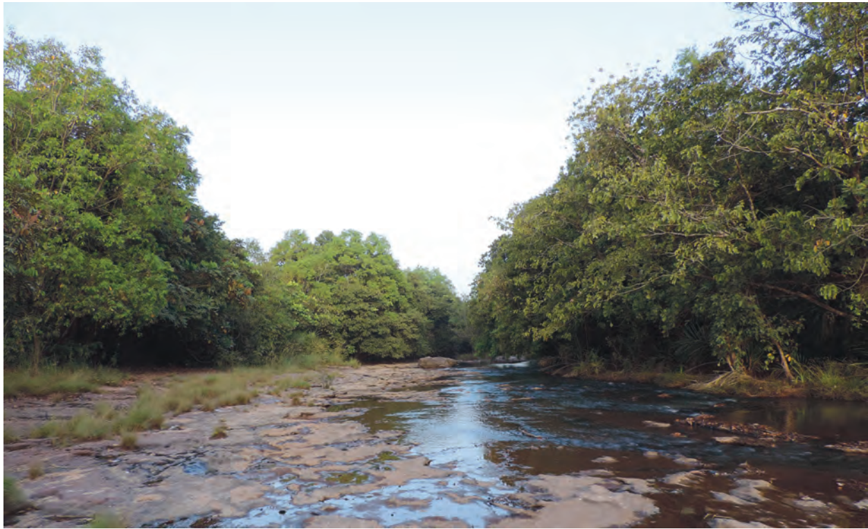
Fig. 7. The Farako River and its forest gallery near Mamoroubougou, the village where the highest number of snakes and snake species were collected (11°14'N, 05°28'W).