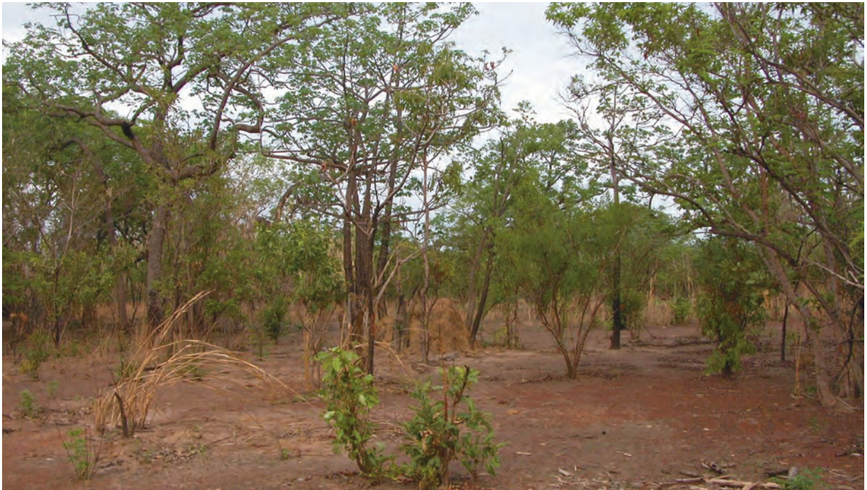
Fig. 9. The Sudanese savanna near Sébékourani village where 28 snake species were collected (12°02'N, 08°44'W). The deadly carpet viper Echis jogeri was abundant.

specimens were reported on a grid map in Trape & Mané (2006b), where the square degree 11°N/5°W was mentioned erroneously.