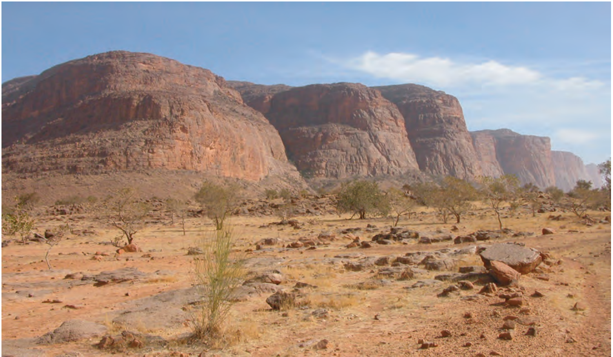
Fig. 11. A view of the Sahelian landscape in the vicinity of Boussouma study village (15°08'N, 02°31'W). Psammophis aff. sibillans , Naja nigricollis and Echis leucogaster were the most abundant species, but Python sebae was also collected in a pound.