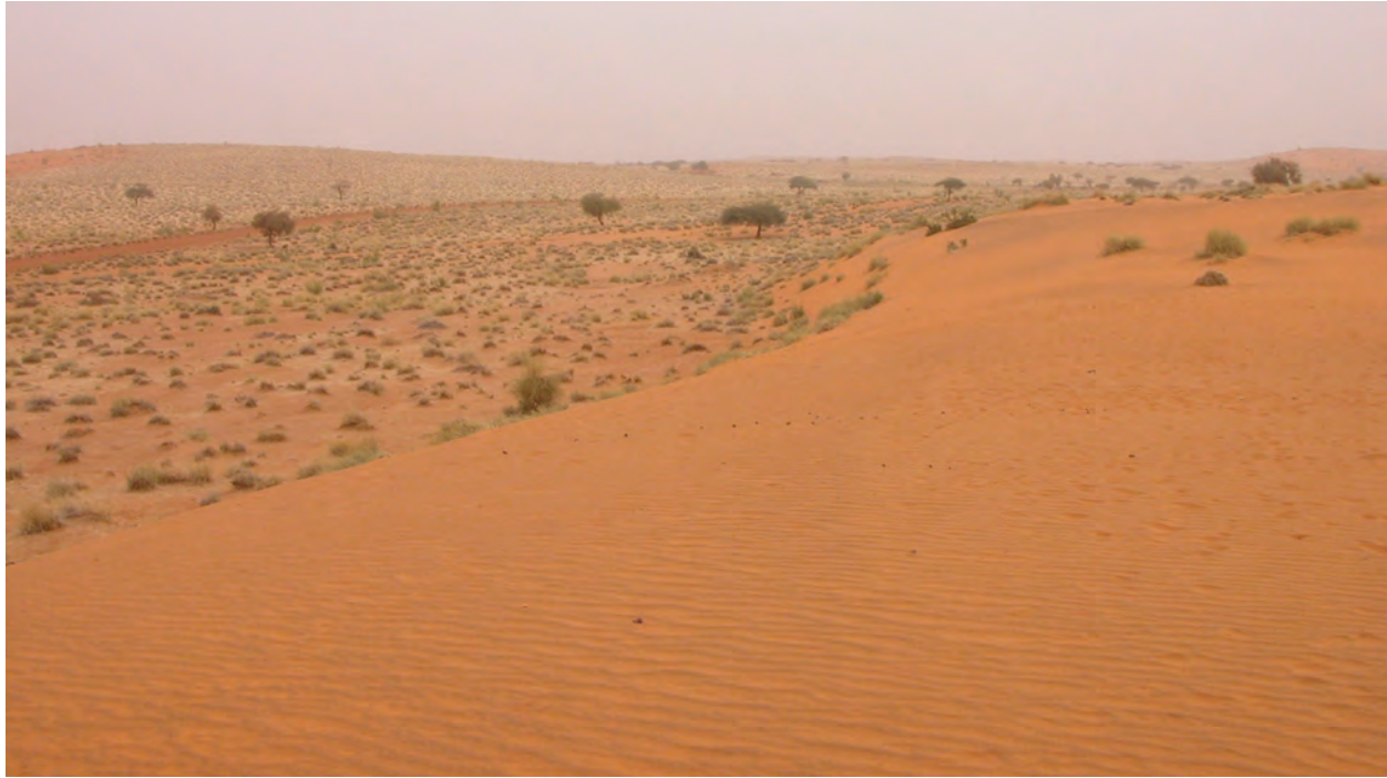
Fig. 12. Vicinity of Haoussa Foulane village (16°00'N, 00°08' W), an area of Sahelo-Saharan transition where Echis leucogaster , Eryx muelleri , Psammophis aff. sibilans and Rhagerhis moilensis were collected.