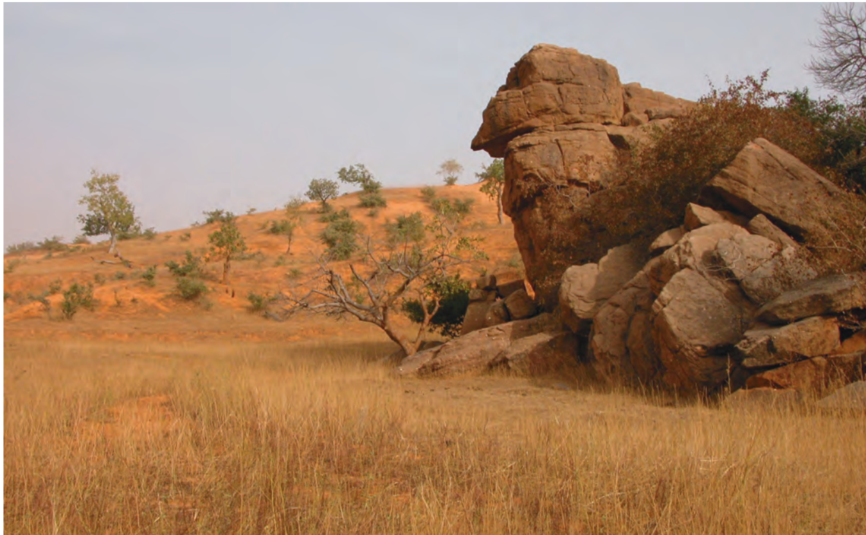
Fig. 10. Near Bandiagara cliff, an area of transition between the Sudanese savanna and the Sahel (14°02'N, 03°46'W).