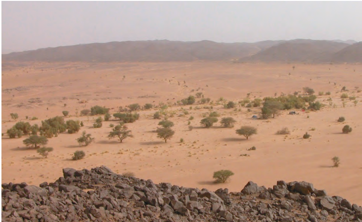
Fig. 1. A typical sandy valley and wadi in the mountains of the Adrar des Iforas (19°01'N, 01°50'E).