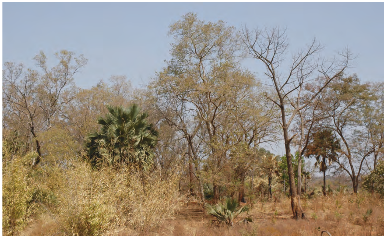
Fig. 8. The Sudanese savanna between Koundian and Bangaya villages in southwestern Mali (13°10'N, 10°38'W).