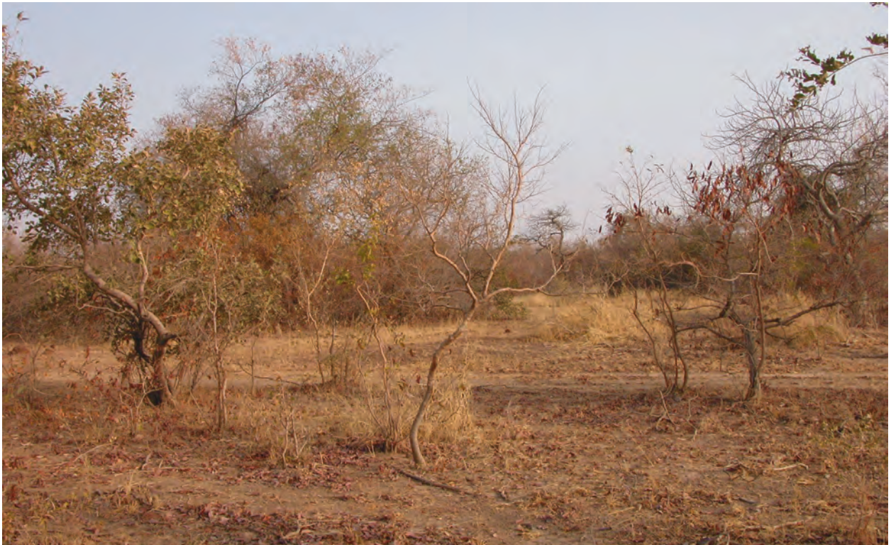
Fig. 3. Sudanese savanna in eastern Mali, west of Niamasso study village (13°02'N, 05°47'W).

try (17 localities between 14°16'N and 16°45'N), where average annual rainfall ranges approximatively from 1,000–1,100 mm, 500–1,000 mm, and 200–500 mm, respectively (Mahé et al. 2012). The most Saharan part of the country, i.e. north of 17°N, was not surveyed except during a two-week period in February 2004. Although no specimen was collected during these two weeks, some information on records of Cerastes cerastes Linnaeus, 1758 and C. vipera (Linnaeus, 1758) was obtained from locals (they are indicated as “sight record”).