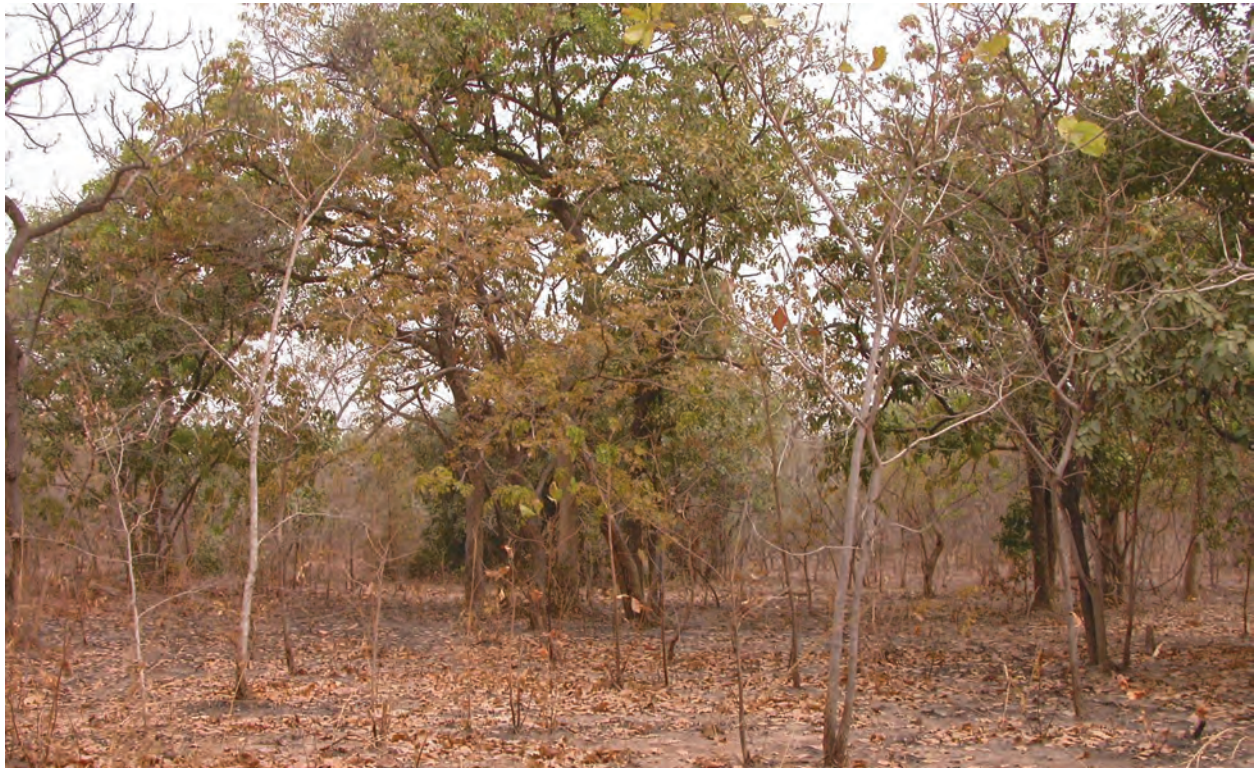
Fig. 4. Sudano-Guinean savanna in the vicinity of Doussoudiana, the southernmost village of the study (11°11'N, 07°44'W).