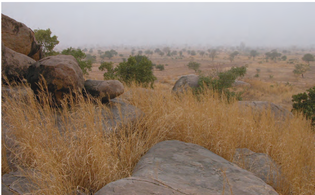
Fig. 2. View of the Sahelian vegetation in western Mali, near Samé Ouolof study village (14°33'N, 11°20'W).