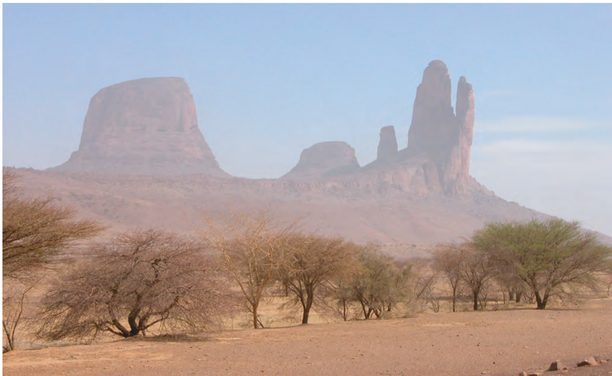
Fig. 5. The Hombori Mountains, the highest mountains of Mali (15°14'N, 01°48'W).