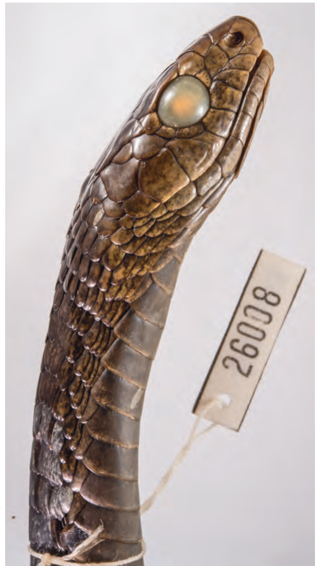
Fig. 4. Thrasops jacksonii (ZFMK 26008) from between Katire and Talanga, South Sudan (localities nos. 4 and 5 on Fig. 1).

Remarks. Spawls et al. (2002) listed this widely distributed forest species for Uganda, Kenya, DR Congo, elsewhere south-westwards to northern Angola and westwards to Guinea. Schmidt (1923), Pitman (1974) and Broadley & Howell (1991) reported this species also for Tanzania. In Uganda, this species is more widely distributed in the southwest of the country; otherwise there are only a few scattered records near Entebbe and in the Mabira and Budongo forests (Spawls et al. 2002). Our voucher specimen from south of Yei (Fig. 3) represents, therefore, a considerable range extension to the north and not simply a border-crossing continuation of the Ugandan distribution range.