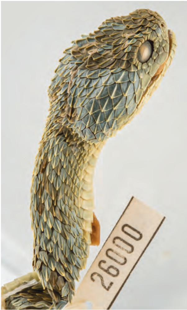
Fig. 7. Atheris squamigera (ZFMK 26000) from Iwatoka/Watoka, South Sudan (locality no. 2 on Fig. 1).