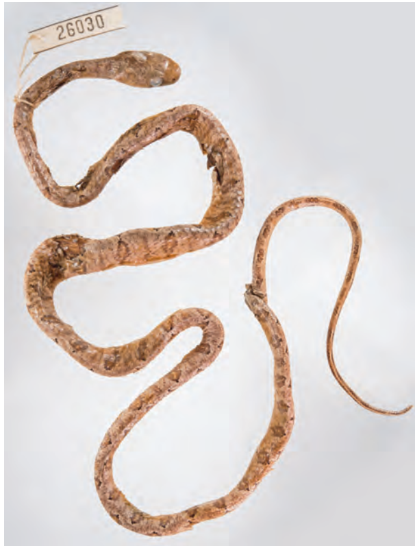
Fig. 5. Toxicodryas pulverulenta (ZFMK 26030) from Talanga Forest, South Sudan (locality no. 4 on Fig. 1).