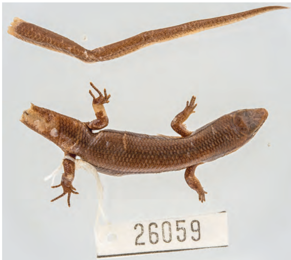
Fig. 2. Leptosiaphos kilimensis (ZFMK 26059) from Mt. Korobe, South Sudan (locality no. 3 on Fig. 1).