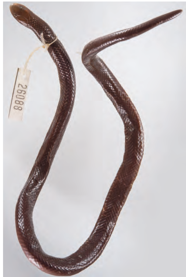
Fig. 6. Amblyodipsas unicolor (ZFMK 26088) from Gilo, South Sudan (locality no. 6 on Fig. 1).

Remarks. Spawls et al. (2002) listed this forest and woodland species (as Boiga pulverulenta ) for Kenya, Uganda and the DR Congo, elsewhere westwards to Guinea and south-westwards to northern Angola. This confirms data from Pitman (1974) and Chippaux (2001). The Ugandan localities listed by Spawls et al. (2002, see also the map by these authors) leave the northern third of the country without records. Thus, again in this case, the geographic distance to the new South Sudanese locality of the specimen ZFMK 26030 (Fig. 5) is remarkable.