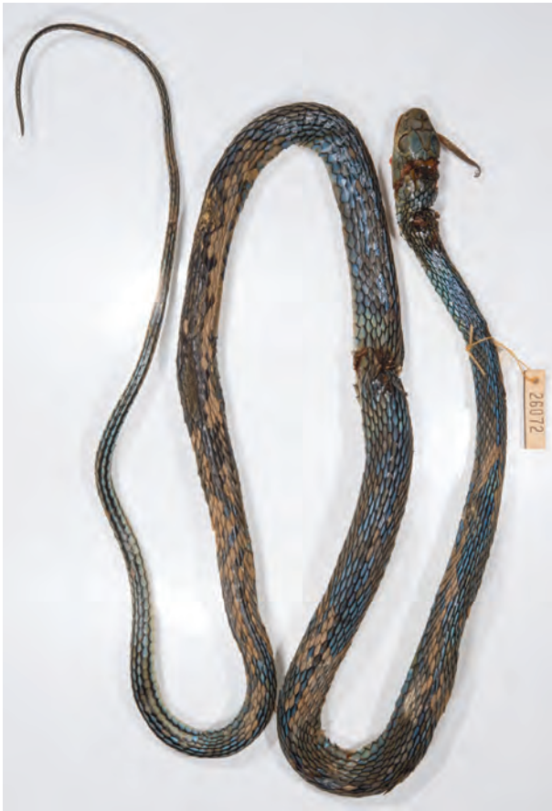
Fig. 3. Hapsidophrys lineata (ZFMK 2626072) from Kajiko North, South Sudan (locality no. 1 on Fig. 1).

Voucher specimen. South Sudan: south of Yei, Mt. Korobe, collected by G. Nikolaus, 28 July 1978 (ZFMK 26059; Fig. 2).