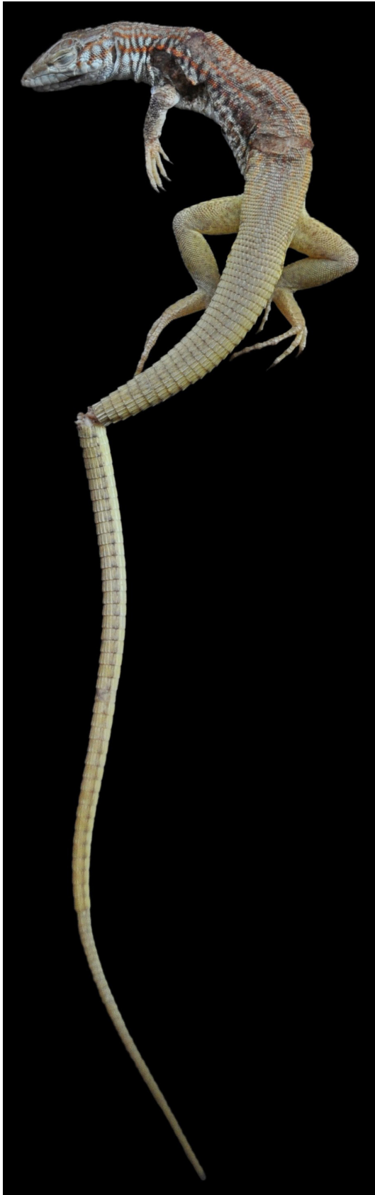
Fig. 13. Latastia longicaudata from Douentza, Mali.