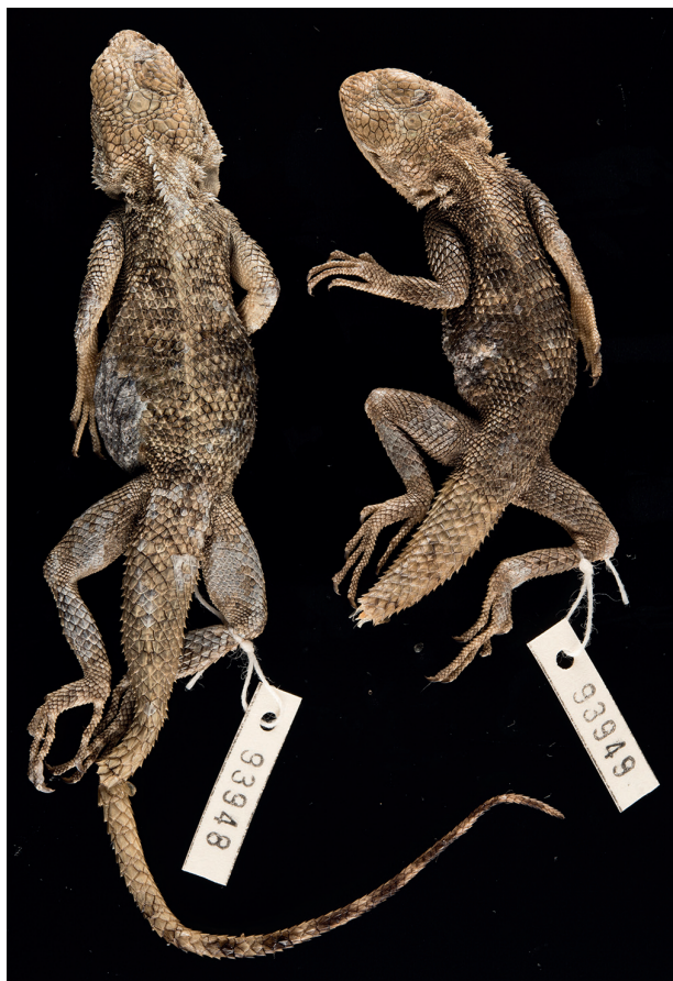
Fig. 9. Agama sp. from Dérégoué, Burkina Faso. Left: male, and right: female.

southeast. Recorded also for the Burkina Faso part of the RBTW in the east of the country (Chirio 2009).