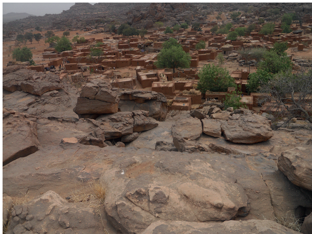
Fig. 2. Anda village, Mali.