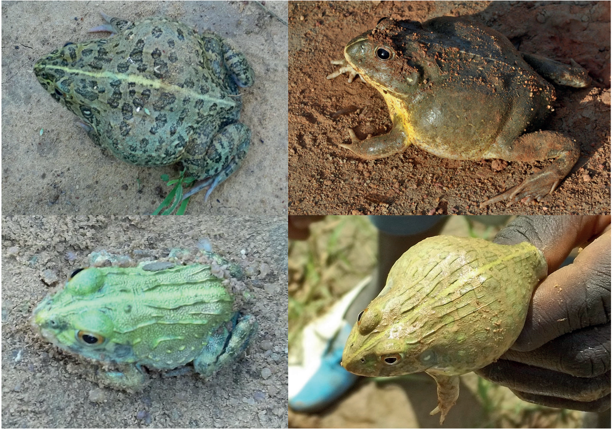
Fig. 7. Four specimens of Pyxicephalus sp. from between Mopti and Sévaré, Mali, to show the variability in color pattern. The specimen on lower left is a juvenile (not on scale).