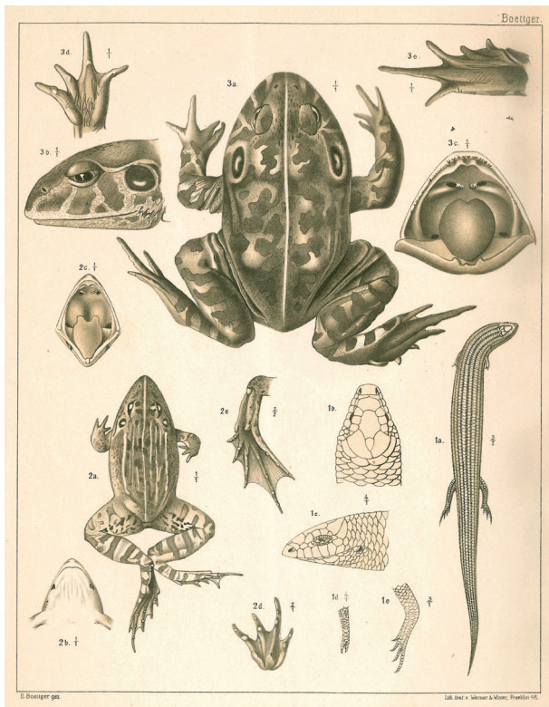
Fig. 6. Plate from Boettger (1881) showing the (presumably lost) type specimens of his Rana (currently Ptychadena ) trinodis (lower left) and Maltzania (currently Pyxicephalus ) bufonia (upper).