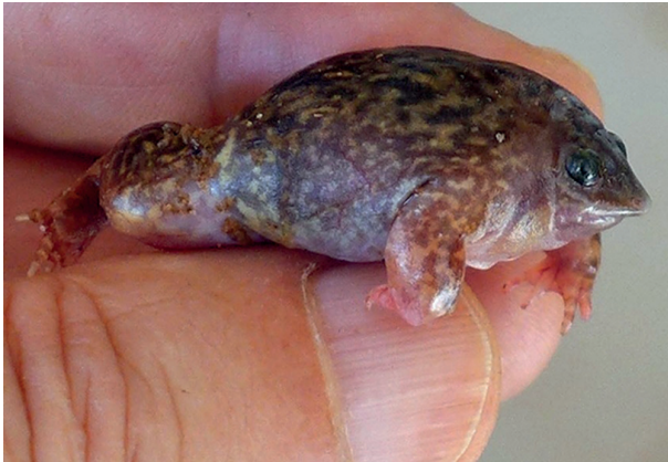
Fig. 11. Hemisus marmoratus from Karankasso-Vigué, Burkina Faso.

Tarentola cf. ehippiata O'Shaugnessy, 1857