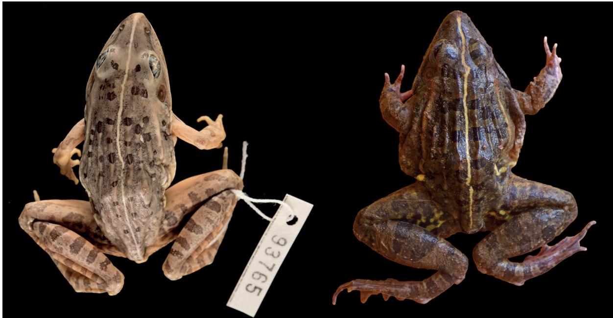
Fig. 5. Ptychadena trinodis from between Douentza and Boni, Mali. Left: ZFMK voucher; right: specimen not collected.