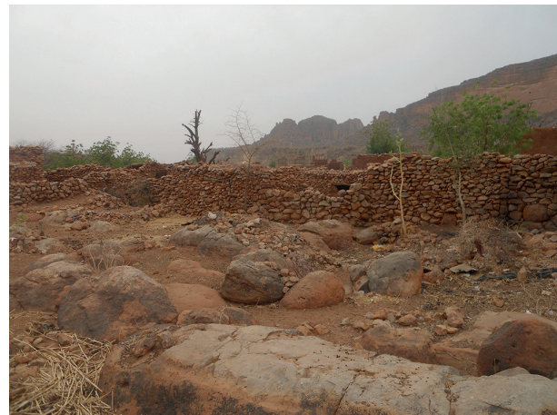
Fig. 3. Pergué village, Mali.

The area between Douentza and Bandiagara was visited several times, in 2009 (September), 2010 (July) and in 2011/2012, in the course of Dogon linguistic studies carried out by Jeffrey Heath in the Dogon Province. Some amphibians and reptiles were seen, photographed and – by focal sampling – collected. These voucher specimens are deposited in ZFMK's herpetological collection, as are the photographs in ZFMK's herpetological photo archive.