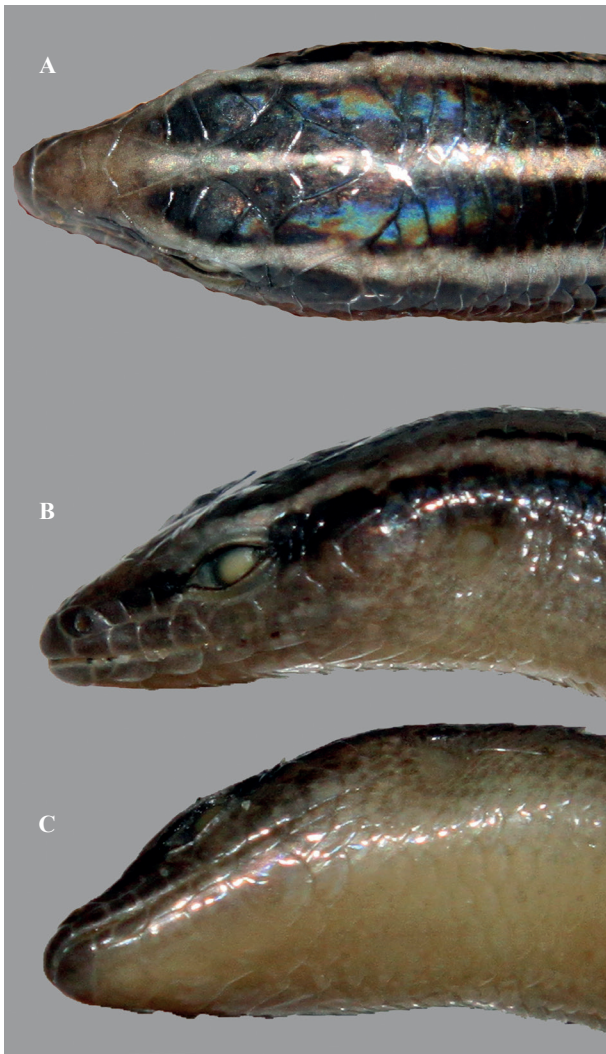
Fig. 2. Head of Lipinia macrotympenum ZSI/ANRC/T/3709. A. Dorsal view. B. Lateral view. C. Ventral view.

the specimen collected (ZSI/ANRC/T/4330) was found resting under a dry palm leaf post noon at ca. 15:18 h. The third, uncollected individual was found foraging on the ground, at the camp site near the tent in Feb 2016. This region (Galathea) is surrounded by Casuarina groves bordering a stretch of a sandy beach near the Galathea River delta. The habitat of this region is generally characterized by reduced canopy cover, low leaf-litter and sandy soil situated close to the sea coast with strand vegetation.