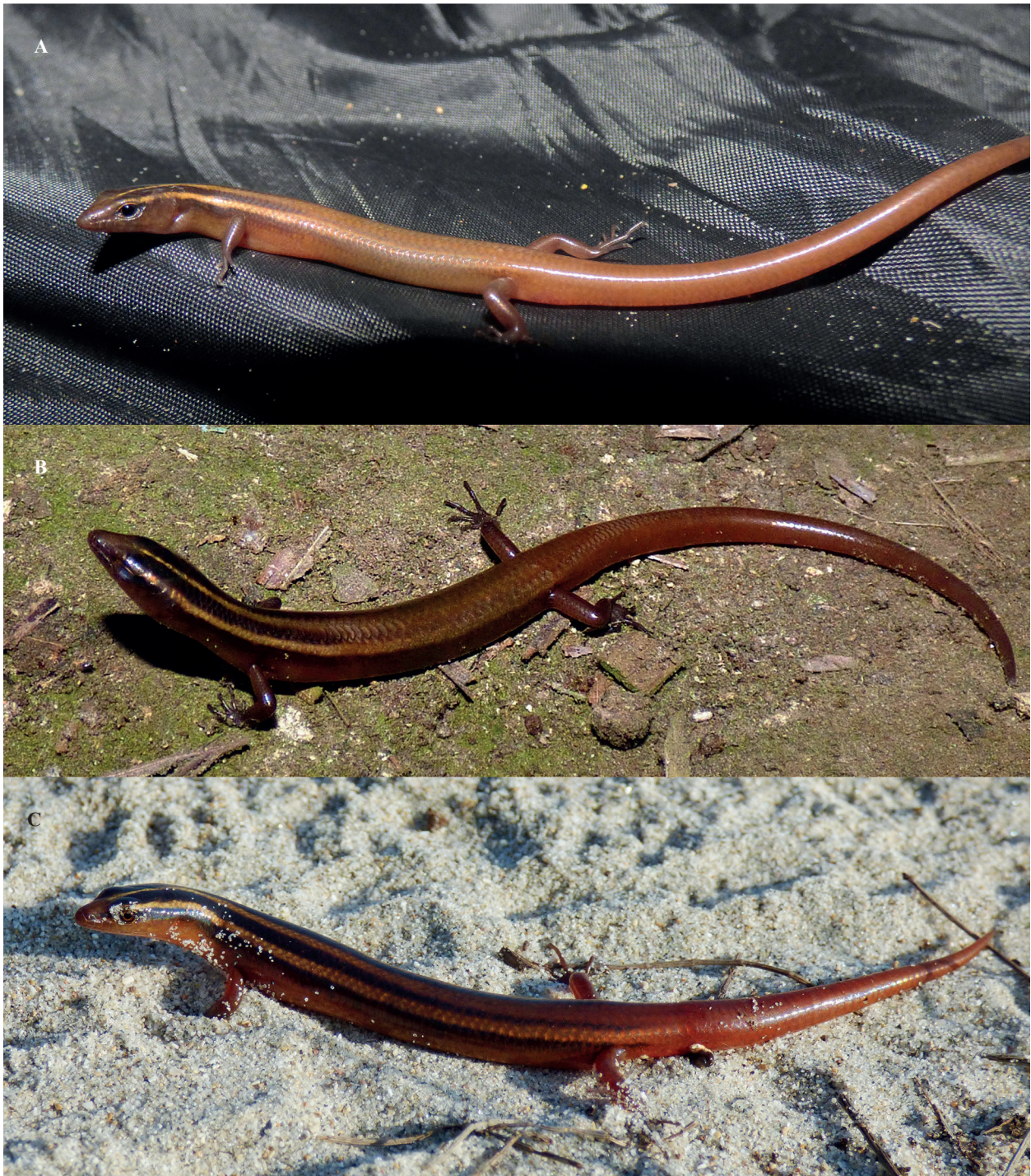
Fig. 1. Lipinia macrotympnum in life. A–B. ZSI/ANRC/T/4330 from Galathea. C. ZSI/ANRC/T/3709 from Shastri Nagar.

reported herein has not been known until now. Illustration of this species published by Das (2002) conforms to the coloration of ZSI/ANRC/T/3709.