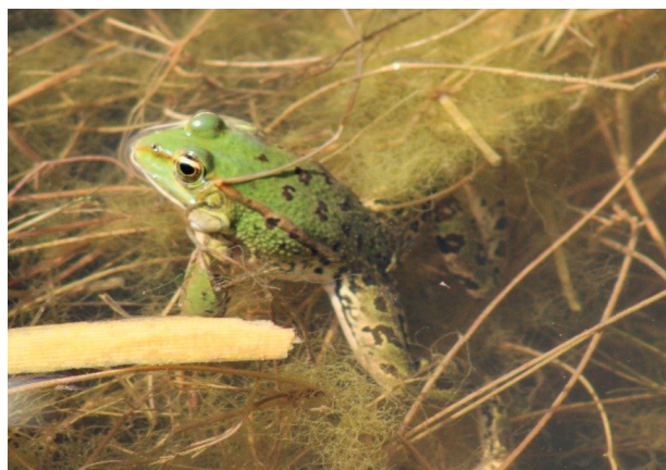
Figure 1. Sahara frog ( Pelophylax saharicus ) in Guelma, northeast Algeria.

For this paper, we carried out a common garden experiment on the North African endemic Sahara frog ( Pelophylax saharicus ) (Figure 1) collected from different types of environments to assess adaptive mechanisms in life history. In particular, we estimated the growth rate of four populations in the presence and absence of chemical cues of predators (large dragonflies). We used a laboratory setting with standardized conditions based on two morphological traits (body weight and snout-vent length).