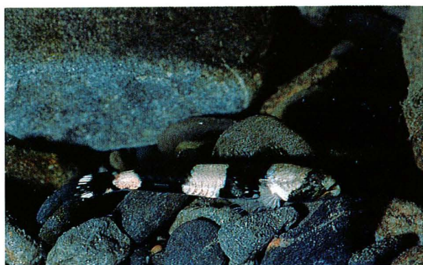
Fig. 2. In tank, Schismatogobius amplusvinculus n. sp., paratype.