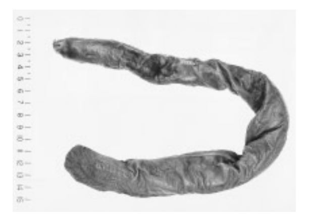
Fig. 5. Paramyxine atami, TUM 9696, 430 mm TL.

Description: Six pairs of gill pouches and apertures; GA closely spaced in a fairly straight