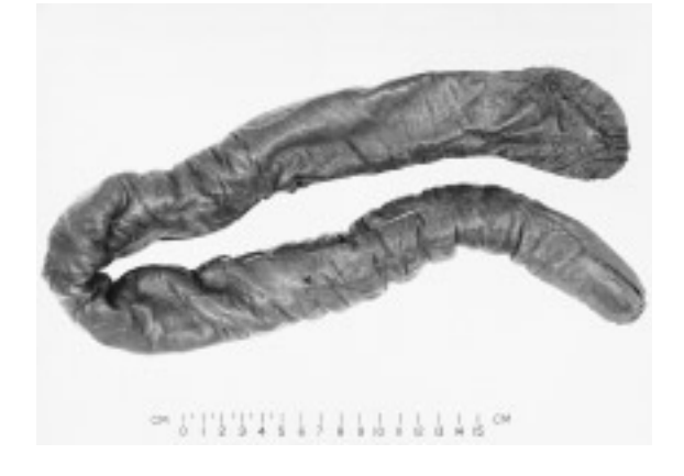
Fig. 4. Eptatretus okinoseanus, FMNH 71701, 699 mm TL.

Diagnosis : Eight pairs of gill pouches and apertures, GA well spaced in a straight line; 3/2 fused cusps, total cusps 44-49; total slime pores