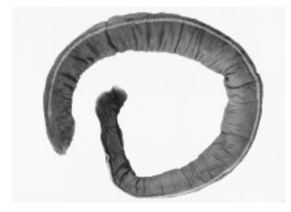
Fig. 2. Eptatretus burgeri, UMMZ 190386, 365 mm TL.

and were seen in shallow water near the steps of the Misaki Marine Laboratory. Strahan (1962) presented an intensive study of freshly collected specimens of E. burgeri ; his data are included with our results and those of Fernholm (1998) in table 1.