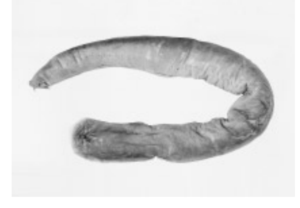
Fig. 9. Quadratus taiwanae, SIO 02-99, 213 mm TL.