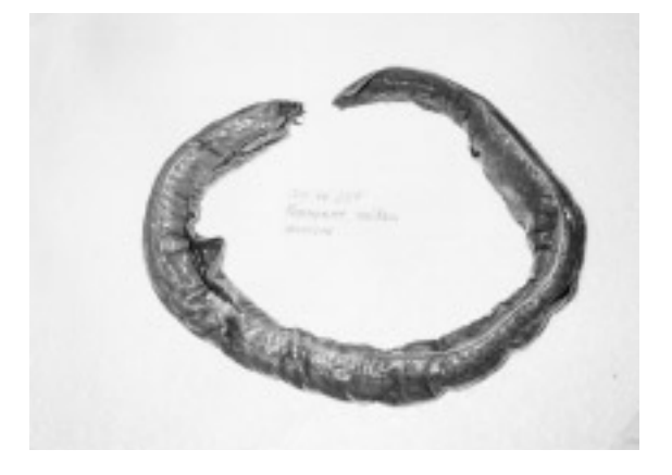
Fig. 7. Paramyxine walkeri sp. nov., SIO 76-257, 450 mm TL.

Description: Six (rarely 5) pairs of GP and apertures; GA closely spaced but not crowded, in a linear or slightly irregular pattern, last left GA usually confluent with PCD, each GA with pale margin; 1-2 GP at end of DM; VA splitting at 3rd or 4th GP. The following counts and body proportions are the data from the Choshi specimens (SIO 76-257) followed by those from the Sea of Japan collections in brackets: Fused cusps 3/2 [3/2], AUC