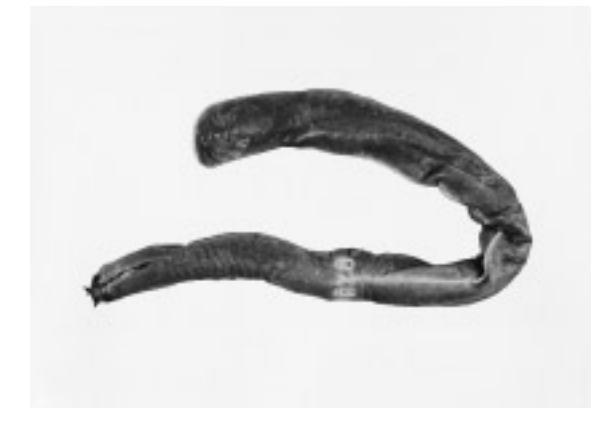
Fig. 10. Quadratus yangi, SIO 76-255, 224 mm TL.