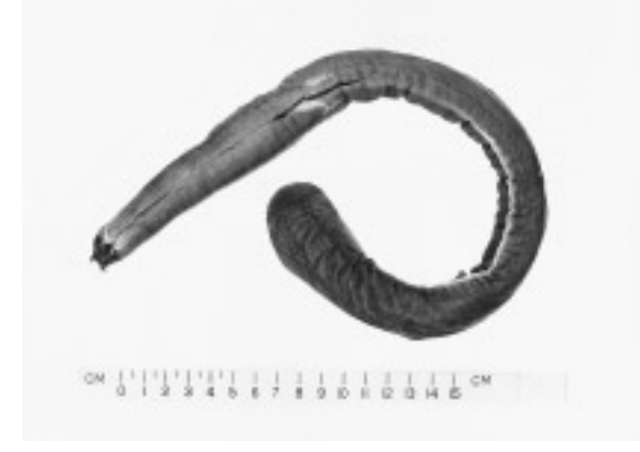
Fig. 6. Paramyxine moki sp. nov., SIO 87-104, 470 mm TL.

Description : Gill pouches and apertures 6; GA in a straight or slightly irregular line; the first GA opposite the 5th or 6th GP; 1 GP on right and 2 GP on left side along end of DM; VA splitting at 3rd or 4th GP. Fused cusps 3/2, AUC 6-8, PUC 7-9, total cusps 38-43. Slime pores: PBR 18-21 + BR 0 + TR 44-50 + TA 10-14, total pores 75-82. Body proportions: PBR 26.8%-30.9%, BR 1.4%-3.0%, TR 49.2%-55.1%, TA 15.4%-19.5%, body width at