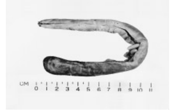
Fig. 8. Quadratus nelsoni, SIO 80-215, 247 mm TL.