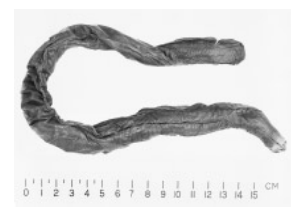
Fig. 12. Myxine garmani, UMMZ 190387, 592 mm TL.