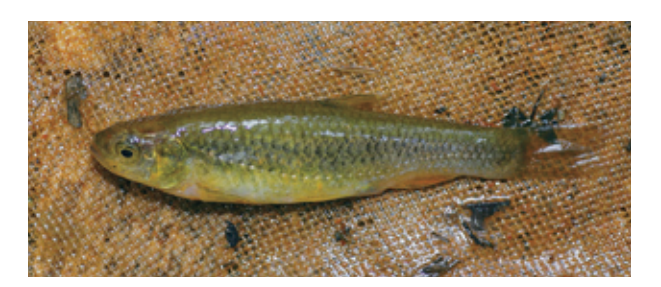
Fig. 2. Aphyocypris amnis sp. nov., live specimen, about 50.0 mm SL. Taiwan: type locality.