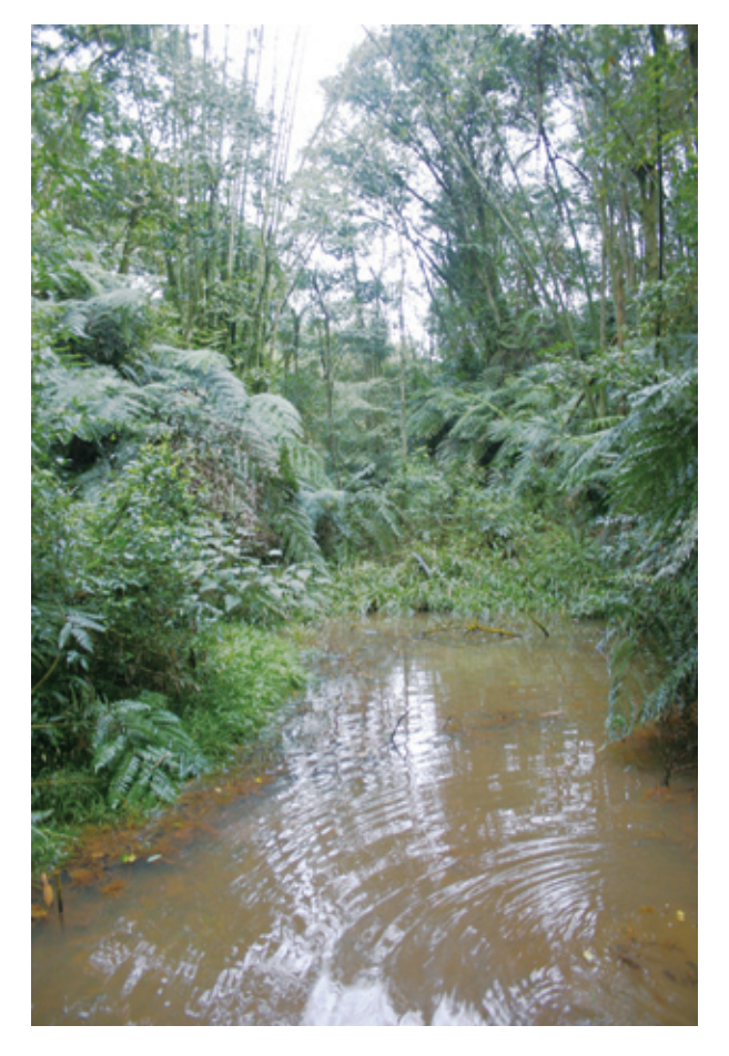
Fig. 5. Nantou, Taiwan: type locality of Aphyocypris amnis sp. nov.

Etymology : From the Latin amnis , a stream, in allusion to its distribution in only 1 river drainage; treated as a noun in apposition.