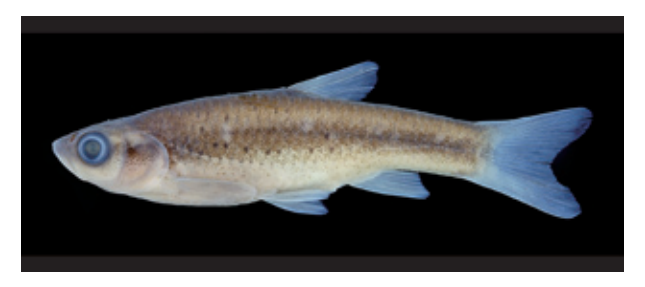
Fig. 1. Aphyocypris amnis sp. nov., holotype, ASIZP 0072172, 39.2 mm SL.

Description: Refer to figure 1 for overall