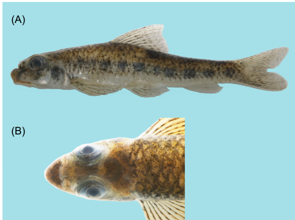
Fig. 2. The specimen photographs of Microphysogobio zhangii n. sp., (A) holotype, ASIZB 204677, 77.1 mm SL. (B) the same individual, dorsal view of head.

ichthyologist “Professor Chunguang Zhang” in recognition of his great contribution to the fish taxonomic studies in China.