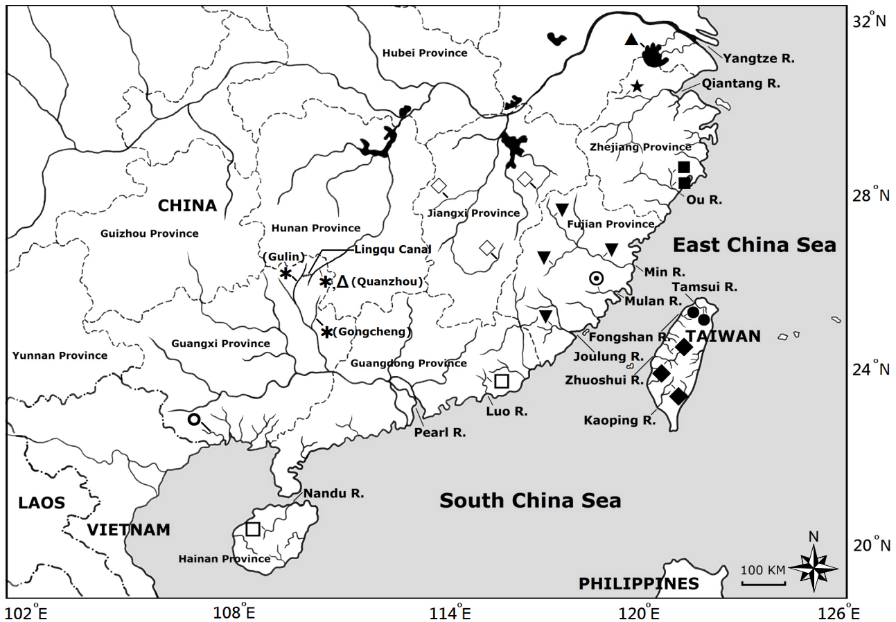
Fig. 3. The Sampling localities of Microphysogobio zhangii n. sp., and comparative materials from southern China and Taiwan. *, Microphysogobio zhangii n. sp.; ◆, M. alticarpus ; ●, M. brevirostris ; ■, M. chenhsienensis ; △, M. elongatus ; ◇, M. exilicauda ; ▼, M. fukiensis ; □, M. kachekensis ; ▲, M. microstomus ; ○, M. pseudoelongatus ; ★, M. tafangensis ; ⊙, M. xianyouensis .

Remarks: The molecular phylogenetic evidence of the new species is provided in the next section. Comparing all 19 valid Microphysogobio species from China and two valid species from Taiwan, M. zhangii can be easily distinguished from four valid species ( M. chenhsienensis , M. chinssuensis , M. tafangensis and M. wulonghensis ) by the different types of medial pad on lower lip (centrally divided vs. undivided). As to the remaining 17 species, M. zhangii can be distinguished from M. hsinglungshanensis , M. liaohensis , M. linghensis and M. nudiventris by the different pattern of scale distribution (midventral region covered with scales vs. midventral region naked). Out of the remaining 13 species, M. zhangii can be distinguished from M. amurensis , M. exilicauda , M. tungtingensis and M. yunanensis by having fewer lateral-line scale series (35-