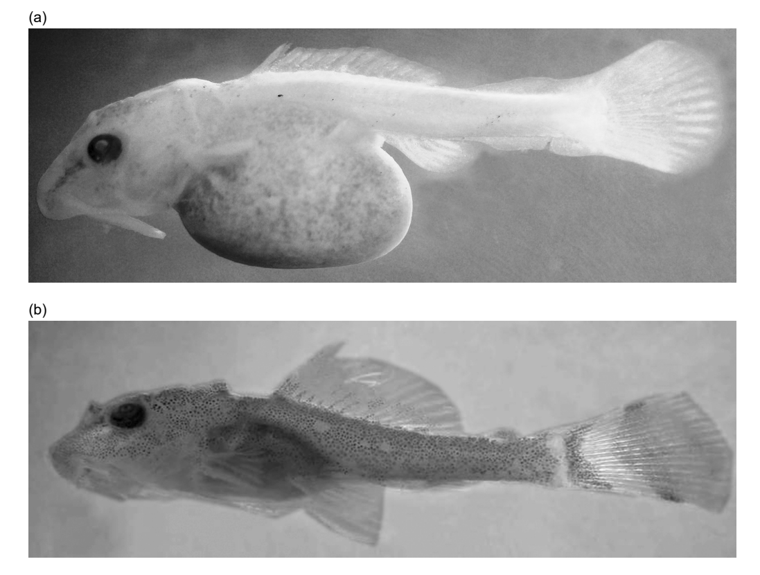
Fig. 1. (a) Lateral view of newly hatched larva of armored catfish Pterygoplichthys ambrosettii , DZSJRP 5196, 8.4 mm SL, showing well-developed yolk sac; (b) post-larva, DZSJRP 5191, 11.7 mm SL. Note yolk sac completely absorbed and dorso-lateral pigmentation.

Newly hatched larvae with well-developed, yellowish yolk sac (Fig. 1a) and no visible myomeres or myosepts. Post-larvae with completely absorbed yolk sac (Fig. 1b) and visible myomeres and myosepts; in cleared specimens without yolk sac (from 11.6 mm), functional digestive system is identified, initially in tube form and subsequently in spiral form. Juveniles with rounded anterior profile, which becomes gradually concave anterior to the supraoccipital process; body with slight predorsal elevation and four series of well-developed longitudinal keels (Fig. 2a). Adults exhibit slight predorsal elevation and well-developed longitudinal keels (Fig. 2b); dorsal profile slightly convex and ascending from snout tip to origin of dorsal fin, descending to adipose fin origin, subsequently ascending and following upper caudal profile; ventral profile is approximately straight.