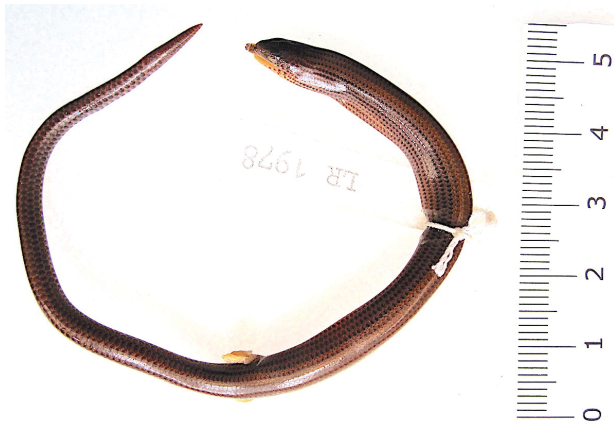
Figure 2. Dorsal view of Scelotes farquharsoni holotype LR 1978.

Pietermaritzburg and Thornville - LR 1959; Durban - LR 1964, 1966, 1970, 1982; Ingwavuma Distr. - LR 955; Ubombo - LR 433-4, 1950, 1953-4, 1958, 1960.