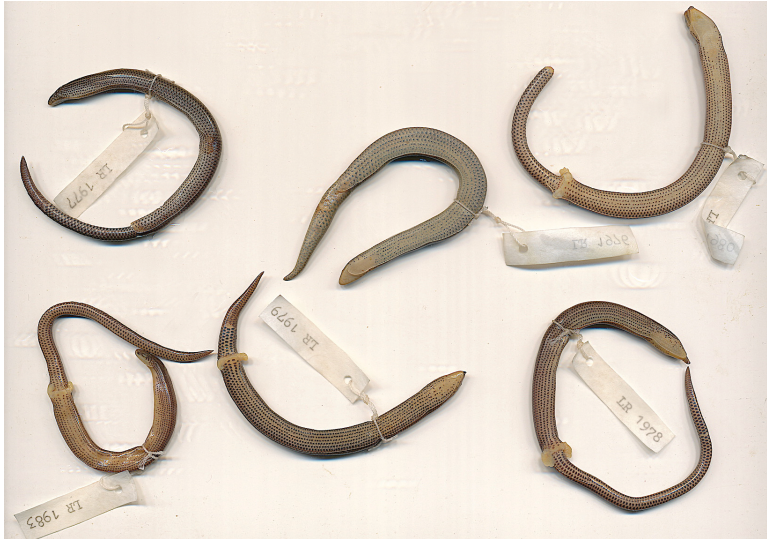
Figure 4. Ventral view of holotype and some paratypes to show variation in patterns.