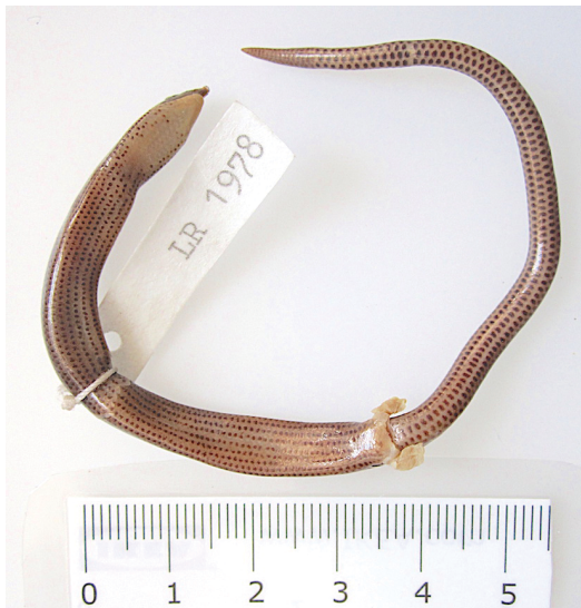
Figure 3. Ventral view of Scelotes farquharsoni holotype LR 1978.