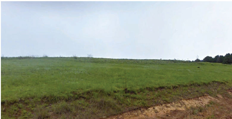
Figure 5. Habitat of S. farquharsoni n. sp. in 'Ngongoni grassveld near Qudeni Forest.