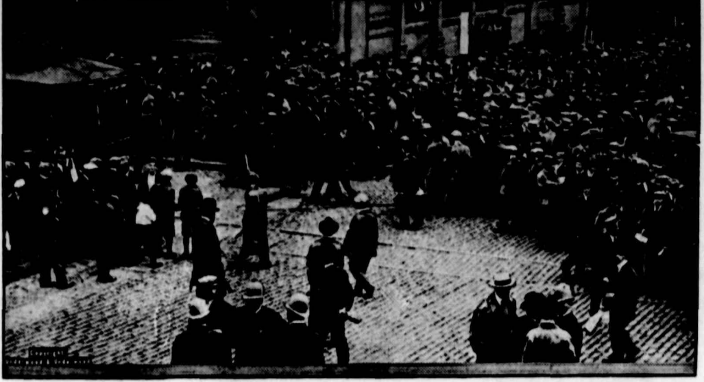
Remarkable photograph showing Harvard students (armed with clubs) and some of the few loyal policemen (wearing helmets) trying to quell a riot in Boston, during the strike of practically the entire police force.