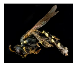
P. octomaculata – Female