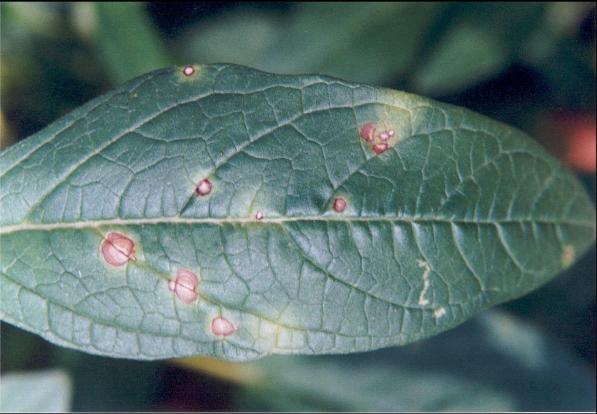
Leaf blight – Alternaria sesami