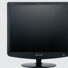
732N / 932B / 732N plus / 932B plus / 932BF