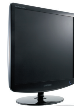
932B plus/732N plus