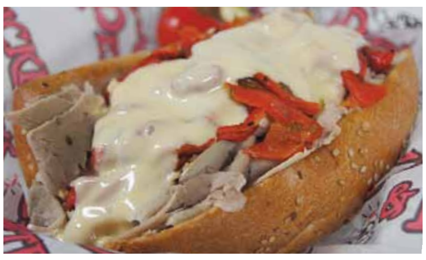
philly style hot roast pork - red style

Fresh jumbo shrimp piled with diced pickle and onion topped with Crabfries<sup>®</sup> and our famous cheese sauce - 6.95