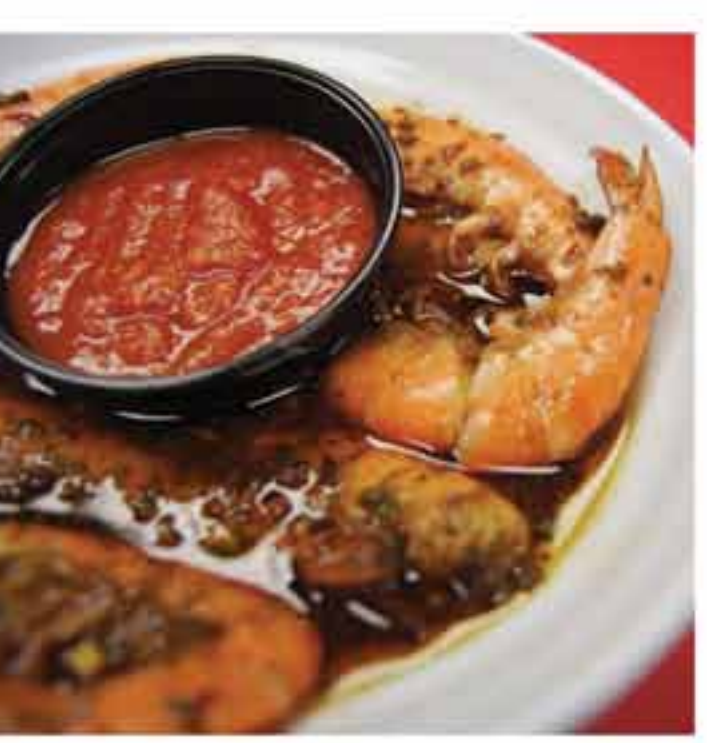
Pick 'em, peel' em, eat 'em!