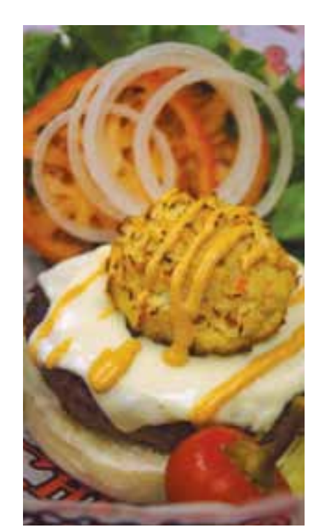
ultimate tailgate burger

A jumbo lump crab cake stacks a Classic, drizzled with our aioli - 12.95