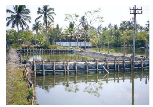
Crab fattening pond

crabs of 550g and above, market demand is more. Hence it is ideal to stock crabs belonging to this size group and then stocking density should not be more than 1 crab/m<sup>2</sup>. Depending upon the location and availability of water crabs, 6-8 cycles of "fattening" can be carried out in a pond during one year by repetitive stocking and harvesting. If the pond is big, it is better to divide the pond into different compartments of suitable sizes for stocking crabs of uniform