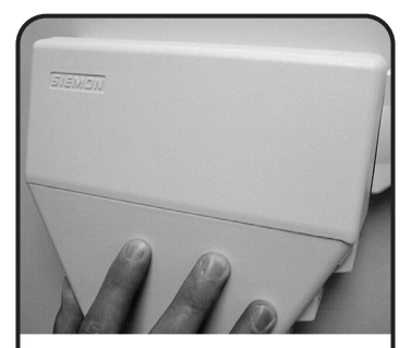
9 Align the housing cover over the base and insert the top latches of the cover into the slots located in the upper wall of the base. Rotate the cover into position until the bottom latches snap into place.