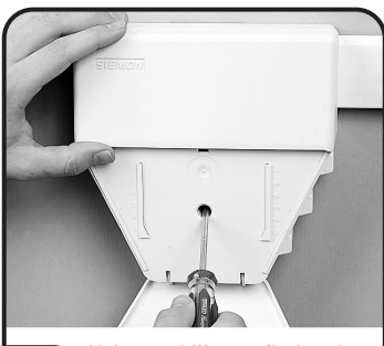
Using a philips or flathead screwdriver tighten the captive screw located under the hinged label cover.