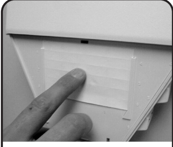
12 Label the outlets accordingly using the label sheet provided.