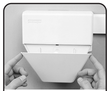
10 Open the hinged label cover by pulling forward on the tabs located on the upper sides of the label cover.