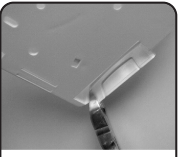
Using wire cutters, remove 2 the appropriate breakout position for cable/raceway entry.