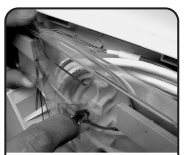
Align the tray into position 7 and push the center latch down to lock the tray to the base. Be careful not to pinch fibers.