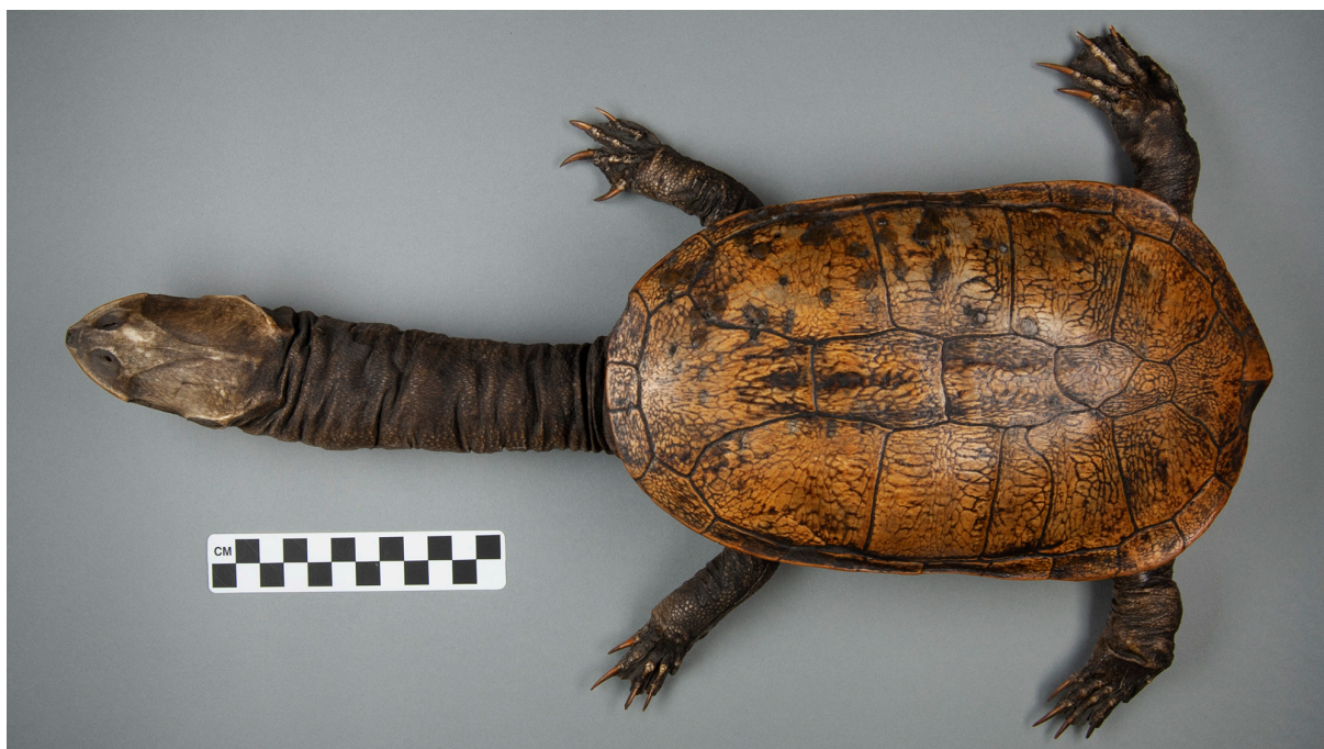
FIGURE 3. Dorsal view of the paralectotype of Chelodina oblonga Gray (OUMNH 02584).