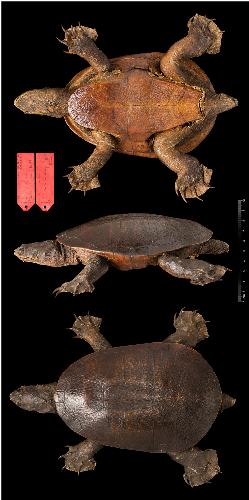
FIGURE 1. Ventral, left lateral and dorsal views of the lectotype of Chelodina oblonga Gray (BMNH 1947.3.5.89). The lateral image is slightly dorsally angled, affecting the profile of the carapace.