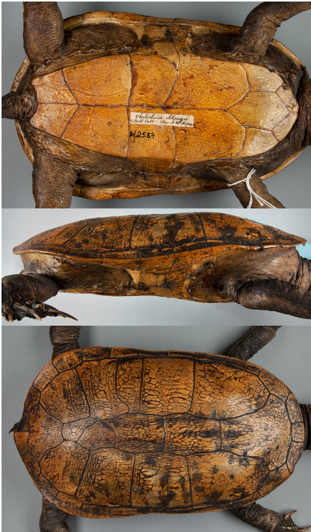
FIGURE 4. Ventral, right lateral and dorsal views of the shell of the paralectotype of Chelodina oblonga Gray (OUMNH 02584).