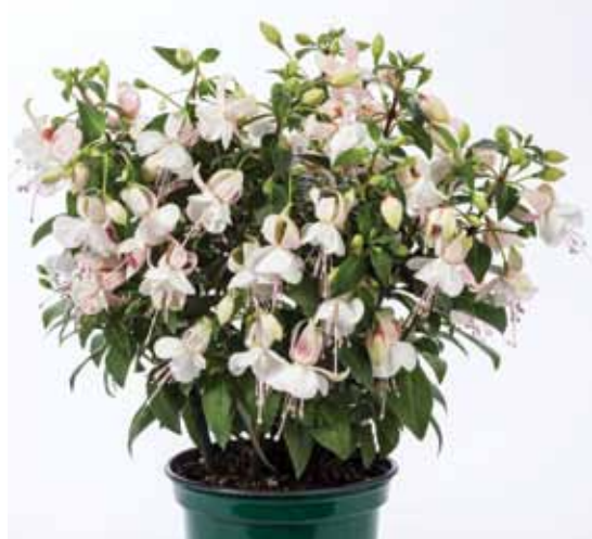
'Windchimes Upright White-White'