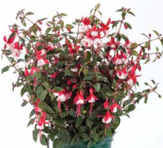
'Windchimes Upright Red-White'

The new Windchimes Upright series from Green Fuse Botanicals represents another jump forward in fuchsia breeding. Their more mounded, upright plant form is ideal for production in 5- to 12-inch containers, and all colors in the series are uniform in flower response