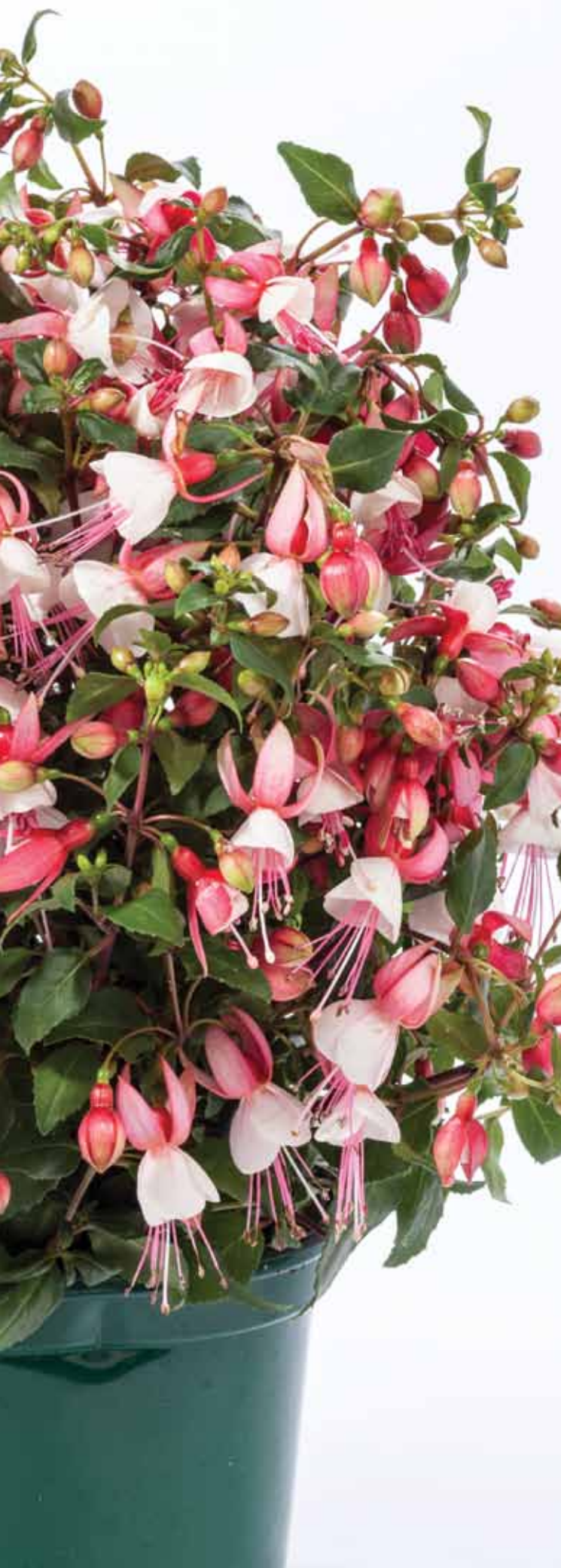
'Windchimes Upright Neon White'