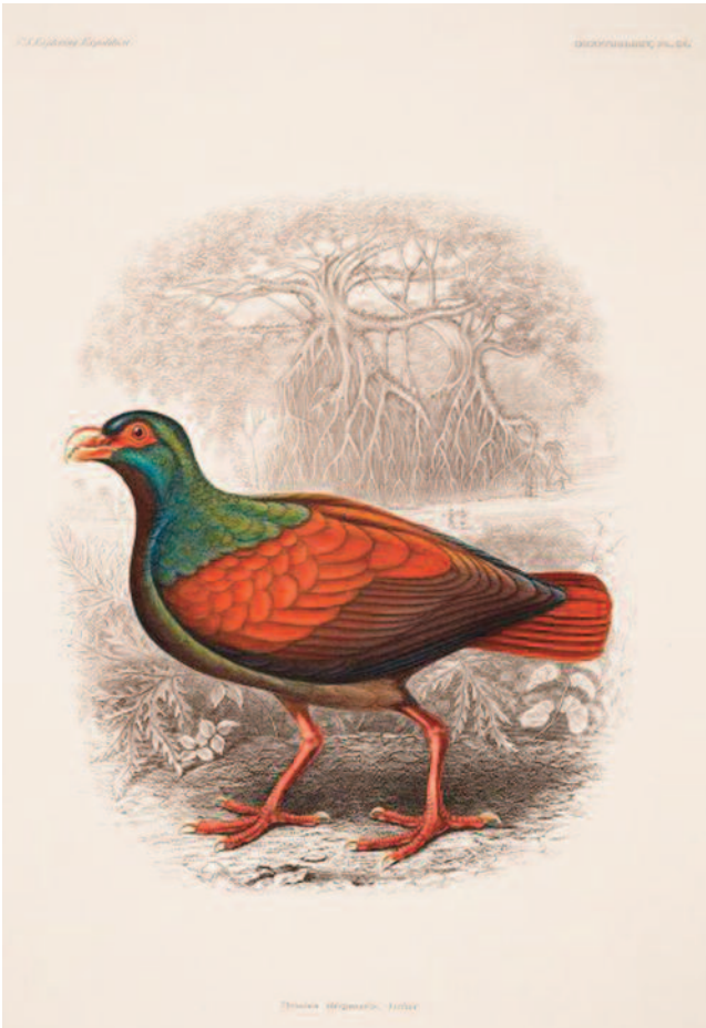
Figure 3. The published plate no. 34 of Cassin (1858b) of the Tooth-billed Pigeon Didunculus strigirostris , revealing the uncoloured background.

the USS Peacock was wrecked on a bar of the Columbia River on 18 July 1841 (Porter 1983: 74, 1985: 304). Peale was eventually compensated for his losses in the amount of $1782.20, plus $1260.27 for salary arrears July 1842 to January 1843 (U.S. 29th Congress, 2nd Session, Bill, H.R. 663, dated 16 February 1847 18 ).