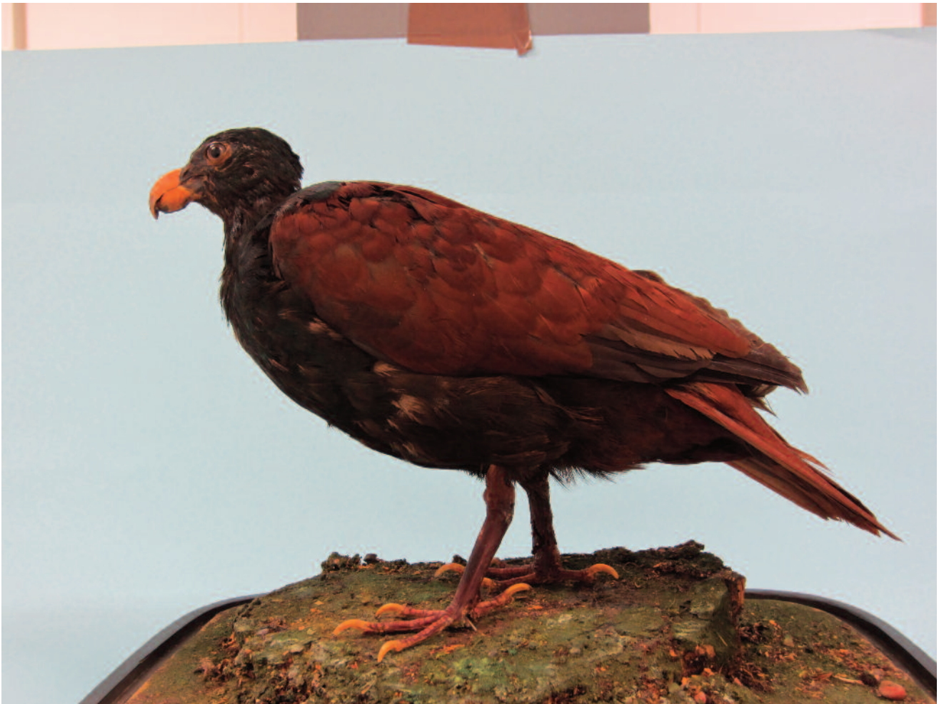
Figure 1. The mounted holotype of Gnathodon strigirostris Jardine 1845. First reproduction of an image of the specimen here presented with the permission of Bob McGowan, National Museums Scotland, Edinburgh, Scotland.

mainder of Jardine's collection (Sclater 1886; Sharpe 1906: 360). Peale (1849: 208–209) did not explicitly indicate that his use of the species-group name, strigirostris , followed Jardine, thus Didunculus strigirostris Peale, 1849, also is an objective junior synonym of Gnathodon strigirostris Jardine, 1845, and objective junior synonym and homonym of [ Didunculus ] strigirostris Jardine, 1845. The original painting Peale provided for the plate of the pigeon, published in 1858 (Cassin 1858b: pl. 34), included a full colour background, missing from the published plate due to cost-cutting measures (Haskell 1942: 56) (see Figures 2 and 3).