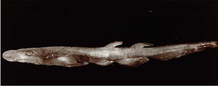
Figure 2. Hawai'i NELHA catshark specimen (BPBM 40879) immature male 174 mm TL.