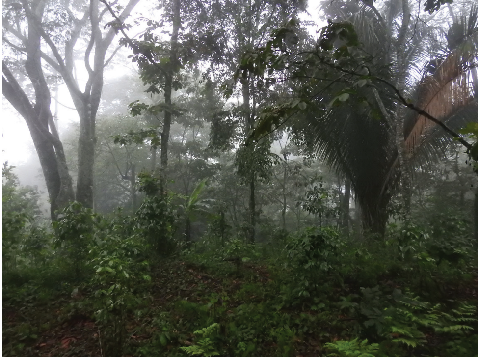
Figure 5. Habitat where holotype of Rhadinaea eduardoi was found.

shade-grown coffee (Fig. 5). The holotype was found active at 1800 hrs on leaf litter approximately 10 m from a stream after a very light rain. Other herpetofaunal species encountered at this site were the anurans Craugastor pygmaeus , Ptychohyala leonhardschultzei , and Exerodonta sumichrasti , and the lizards Norops sp. and Holcosus undulatus .