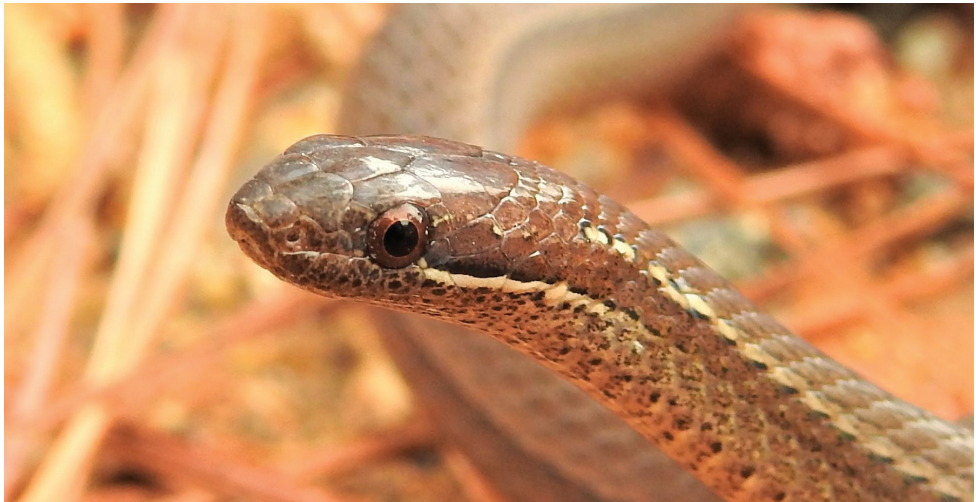
Figure 2. Head and anterior portion of body of holotype of Rhadinaea eduardoi .

Coloration in life of holotype (Figs 2, 3a, b). The dorsum and lateral portion of the head above the pale lip line is Cinnamon-Rufous (color 31). A white line begins posterior to the posteroventral quadrant of the eye and extends posteriorly to disappear on the neck. A white dash outlined above by black is present on the side of the neck about three scales posterior to the parietal scales and is separated from the pale line on the body. The region of the dorsum of the body above scale row five is Hazel (color 26). A disjunct black stripe is present on the middorsal scale row, consisting of a series of black dots, each of which markings occupies the posterior portion of each dorsal