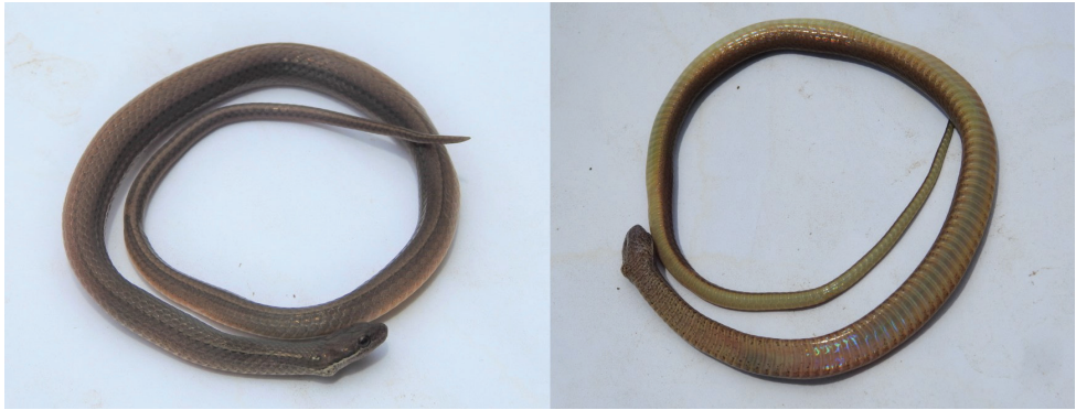
Figure 4. Dorsal and ventral views of the preserved holotype of Rhadinaea eduardoi .

scale. The middorsal and lateral portions of the color pattern are separated by a narrow Pale Buff (color 1) line on scale row five that is bordered below by a black spot on the ventral apex of each scale. The lateral region of the dorsum is Cinnamon-Rufous (color 31) that becomes pale and flecked. The chin and anterior portion of the venter is dark gray flecked with black, grading to cream for the remainder of the venter. The lateral portion of each ventral on the anterior portion of the body bears a black spot.