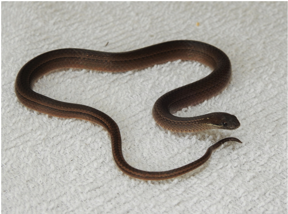
Figure 3. Holotype of Rhadinaea eduardoi in life.