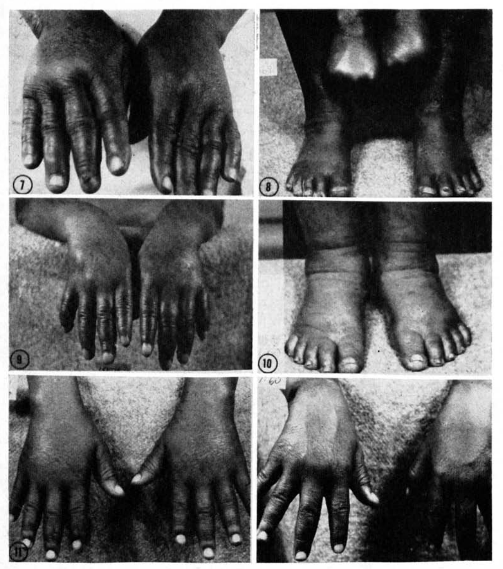
Fig. 7. Fig. 8. Case 13415, tuberculoid leprosy. Acute stage of painful edema of hands.

Case 13652, tuberculoid leprosy. Both the hands and the feet are edematous, and