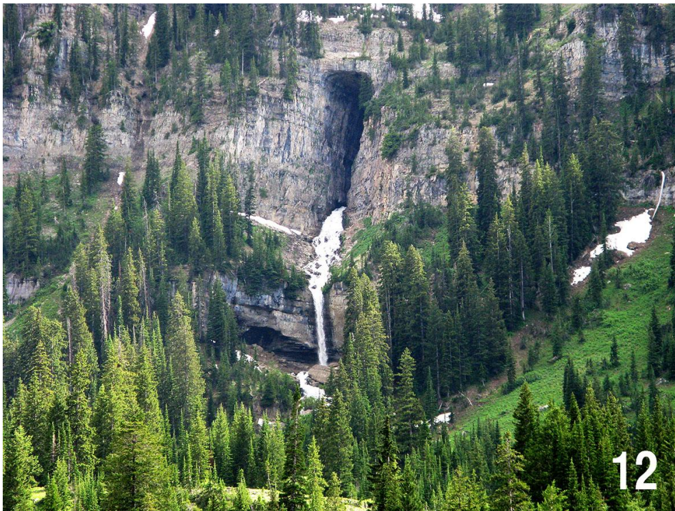
Fig. 12. Wind Cave in summer.