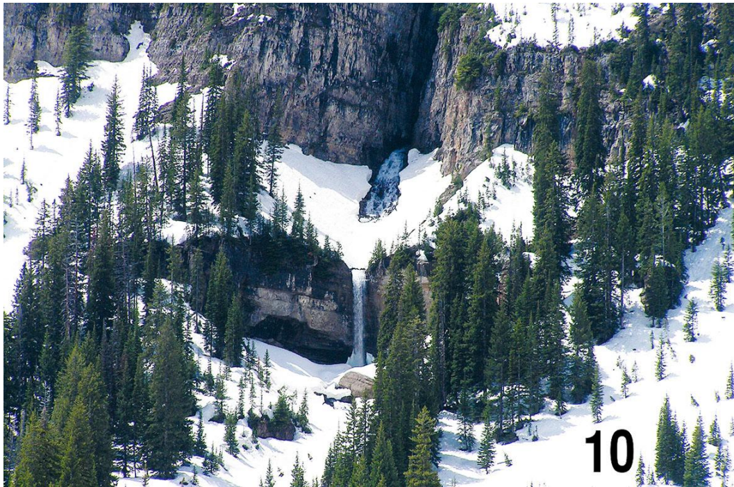
Fig. 10. Wind Cave in winter.