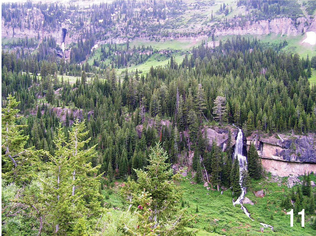
Fig. 11. Wind Cave Valley and waterfall.