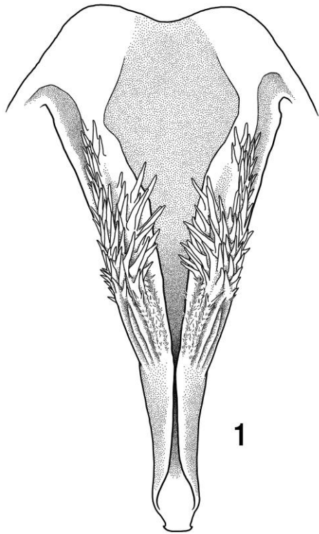
Fig. 1. Lednia tetonica male, epiproct, dorsal.

Material examined. Holotype ♂, USA: Wyoming, Teton County, South Fork, Darby Creek, Wind Cave, southeast of Driggs, Idaho, 27 August 2011, R.G. Call. Paratypes: Same locality and collector, 14 August 2008, 1♀ (BYUC); 11 July 2009, 2♀ (BYUC, RCPC); 27 August 2011, 22♂, 125♀ (BYUC, CSUC, RCPC). Larvae: Same locality and collector, 26 July 2010, 9 larvae (BYUC, RCPC). The holotype will be deposited at the United States National Museum, Smithsonian Institution, Washington, D. C.