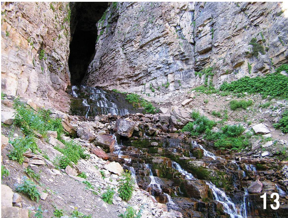
Fig. 13. Wind Cave at mouth.