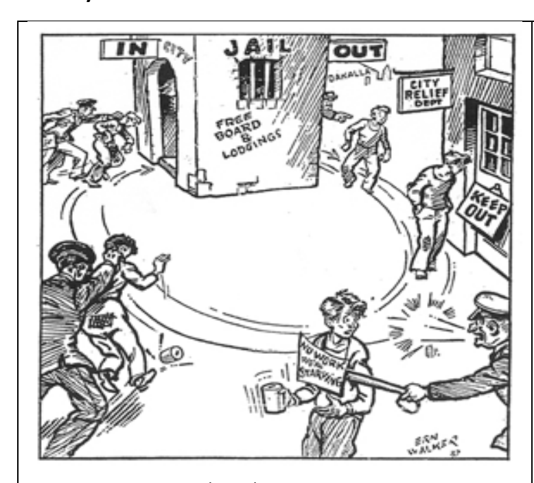
The Federationist, Vancouver 23, June 1938