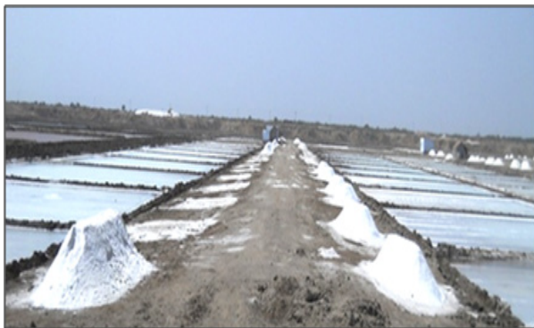
Figure 1 Typical multi-pond solar salterns at Jogrinar located in Kachchh districts of Gujarat, India.

Bacillus , Aidingimonas , Alteromonas , and Chromohalobacter were isolated by Biswas and Paul 47 from multi-pond solar salterns along the coasts of Gujarat (Figure 1), Orissa, and West Bengal, India. Colony morphology of some of the representative members are shown in Figure 2.