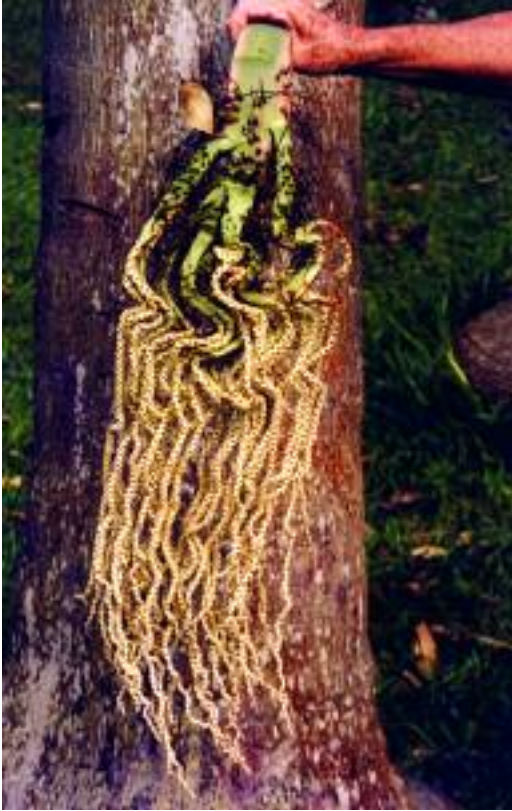
10 (above). Acanthophoenix rubra immature infructescence broken off by a gust of wind at Anse des Cascades. 11 (below). Acanthophoenix crinita : rachilla section with staminate flowers and pear-shaped pistillate flowers ( \times 4.5 ).

base (Fig. 3). The older the specimen, the more swollen the stem base; although it appears that the swelling is more accentuated in Acanthophoenix rubra . This characteristic allows for a larger root system to be in contact with the ground and may give more stability to the palm, an adaptation that may help it to resist cyclone-force winds.