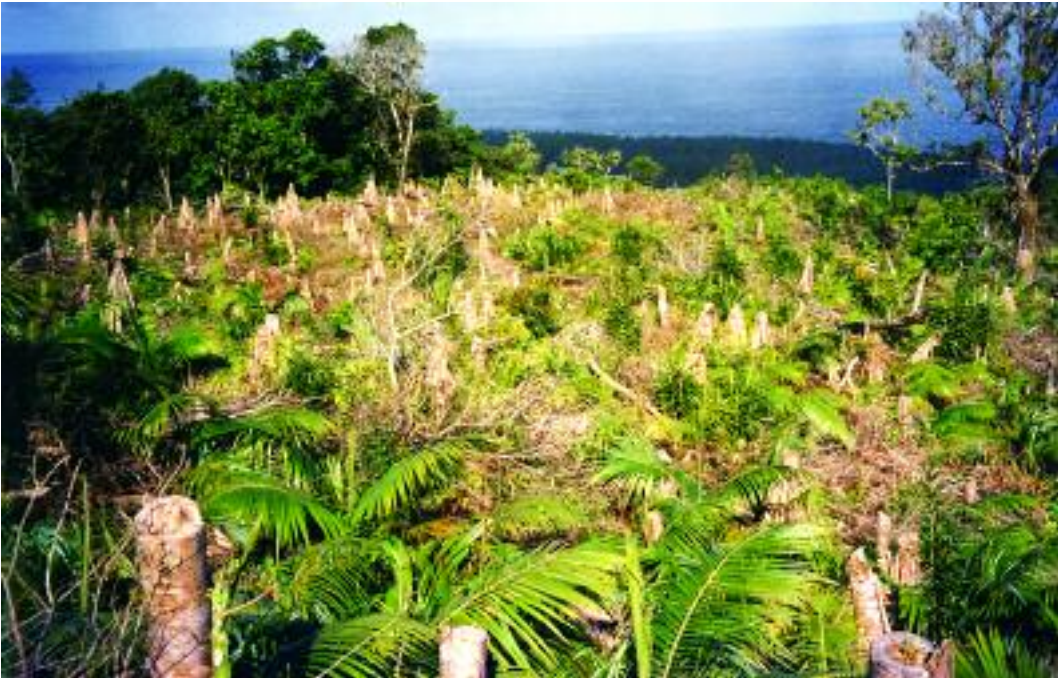
20. A new plantation of Acanthophoenix rubra in Basse Vallée (alt. 300 m) on land previously planted with Pandanus utilis whose stumps are still visible.

Pierre to Saint-Denis, with possible incursions in Cirque de Cilaos and Cirque de Mafate. In Cirque de Cilaos, a village named Ilet Palmistes Rouges is located on the edge of the megathermic semi-dry zone. During the dry months, the lack of rain is made worse because of the presence of a poor soil that does not retain the water. The village name refers to a red palmiste population, of which nothing remains. The local conditions do not allow A. rubra to grow and the “missing” palm may have been A. rousselii . It would also be advisable to search for the hypothetical presence of A. rousselii toward Aurère, in the Cirque de Mafate, where a wild population of Dictyosperma album var. album remains in an out of reach location.