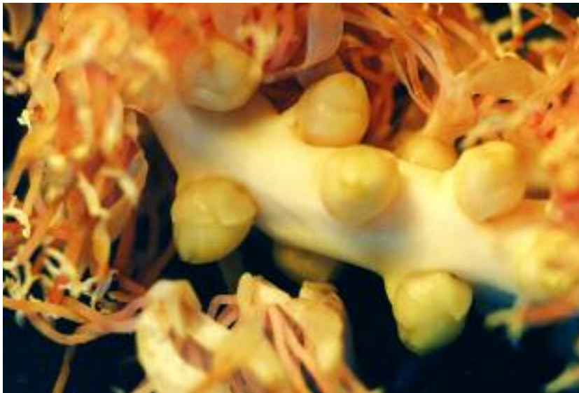
14. Section of rachilla of Acanthophoenix rubra with staminate flowers removed to expose globose pistillate flowers ( \times 4.5 ).

The rachillae bear densely arranged triads of flowers, two staminate flowers flanking one pistillate flower. Staminate flowers have three short triangular sepals and three elliptic, valvate and ivory white petals that are sometimes orange spotted. Stamen number is variable, the rule seems to be: six stamens for A. crinita (Fig. 11), nine stamens for A. rousseii