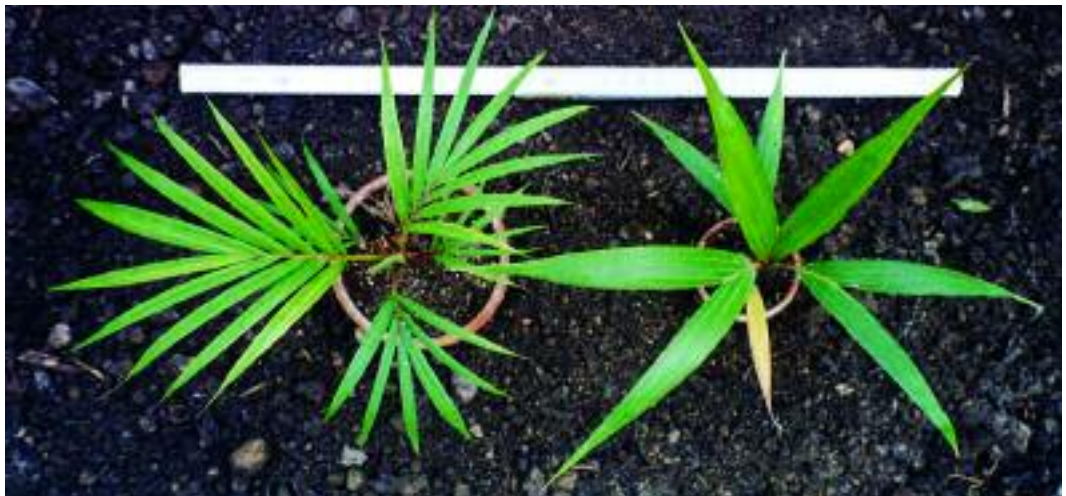
17. Eighteen month old Acanthophoenix rubra (left) and A. crinita (right) in a greenhouse of the City of Paris.

Because of the economic interest of the palmiste rouge , a study on germination ability of seeds was led by CIRAD (Centre de coopération internationale en recherche