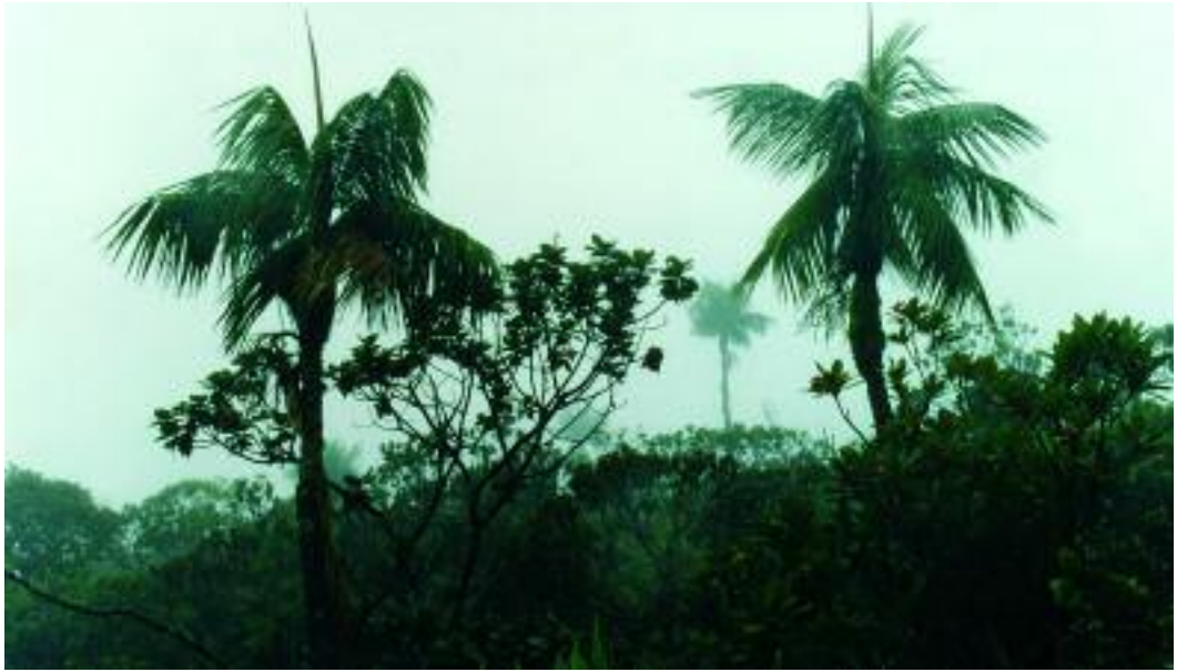
18. A wild population of Acanthophoenix crinita in Hauts de Bois Blanc (altitude 1200 m).

agronomique pour le développement) and Frédéric Normand in 1992. The experiment was done on samples of 300 units, either fruits or seeds. All samples were subjected to different treatments before sowing. The seed containers were wrapped in microporous black plastic film in order to retain optimal moisture and temperature conditions. The first seedlings appeared three months later, but the germination rate, after 250 days, remained rather poor.