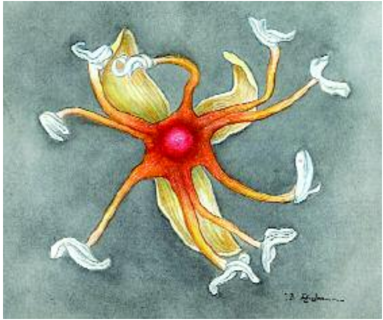
13. Staminate flower of Acanthophoenix rousseii . Watercolor painting by Deborah Roubane.

leaflet midrib is adaxially armed with thin reddish-brown bristles and bears small dot-like scales on abaxial side.