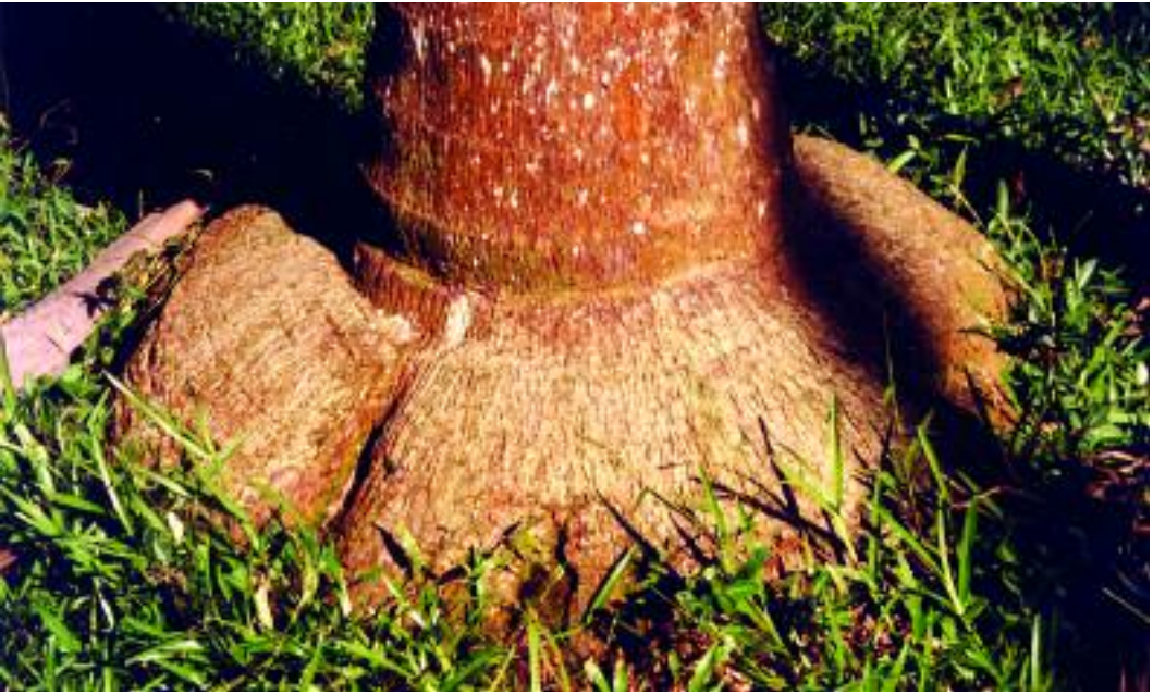
3. Acanthophoenix rubra : stem base shaped like an elephant's foot on an old specimen at Anse des Cascades.

Cadet some 30 years ago, but with his untimely death this third species of Acanthophoenix was forgotten for decades.