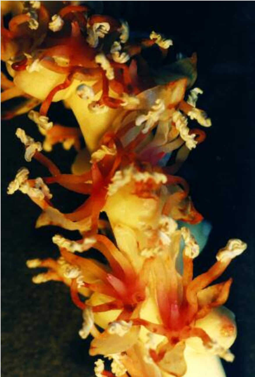
12. Rachilla of Acanthophoenix rousseii : with colorful staminate flowers and sub-globose pistillate flowers ( \times 5 ).

straight, black spines up to 10–12 cm long inserted on a swollen base. On older palms, the sheaths become unarmed and as smooth as velvet (Fig. 5). Leaf sheaths of Acanthophoenix rousseii are dark brown, densely covered with short soft hair (Fig. 6). The crownshaft of Acanthophoenix crinita often looks swollen (Fig. 7), with the outer sheaths pushed out by young inflorescences; sheaths are brown or light brown and covered with stiff hairs reminiscent of “tangué” (tenrec) fur ( Tanrec ecaudatus ) (Fig. 8).