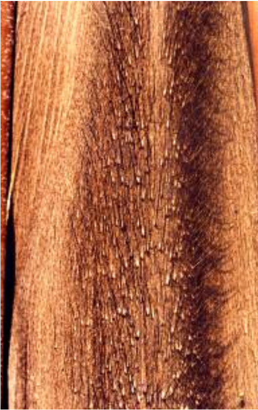
8 (above) Acanthophoenix crinita : close-up of leaf sheath showing stiff bristles resembling tenrec fur. 9 (below). Acanthophoenix crinita : spathe opening on young inflorescence on the right and infructescence on the left.

and glabrous. Staminate flowers 12 \times 12 mm, ivory white turning to light yellow except pistillode and basal part of filaments pink-colored; sepals 3, narrow triangular with acute tip, 1.5 mm long; petals 3, elliptic, valvate, 7 \times 3 mm; stamens 9 (sometimes 8) with white sagittate anthers 3–4 mm long and coiled filaments 8 mm long; pistillode 2–3 mm with trifid tip. Pistillate flowers ivory-white, globose to subspherical, slightly asymmetrical, smaller than staminate flowers 4.5 \times 3 –4 mm; sepals and petals similar, membranous, imbricate. Mature fruit black with persistent beige or light brown perianth, ellipsoidal and slightly curved, 15 – 20 \times 8 mm; mesocarp thin, dark purple; endosperm homogenous, embryo basal.