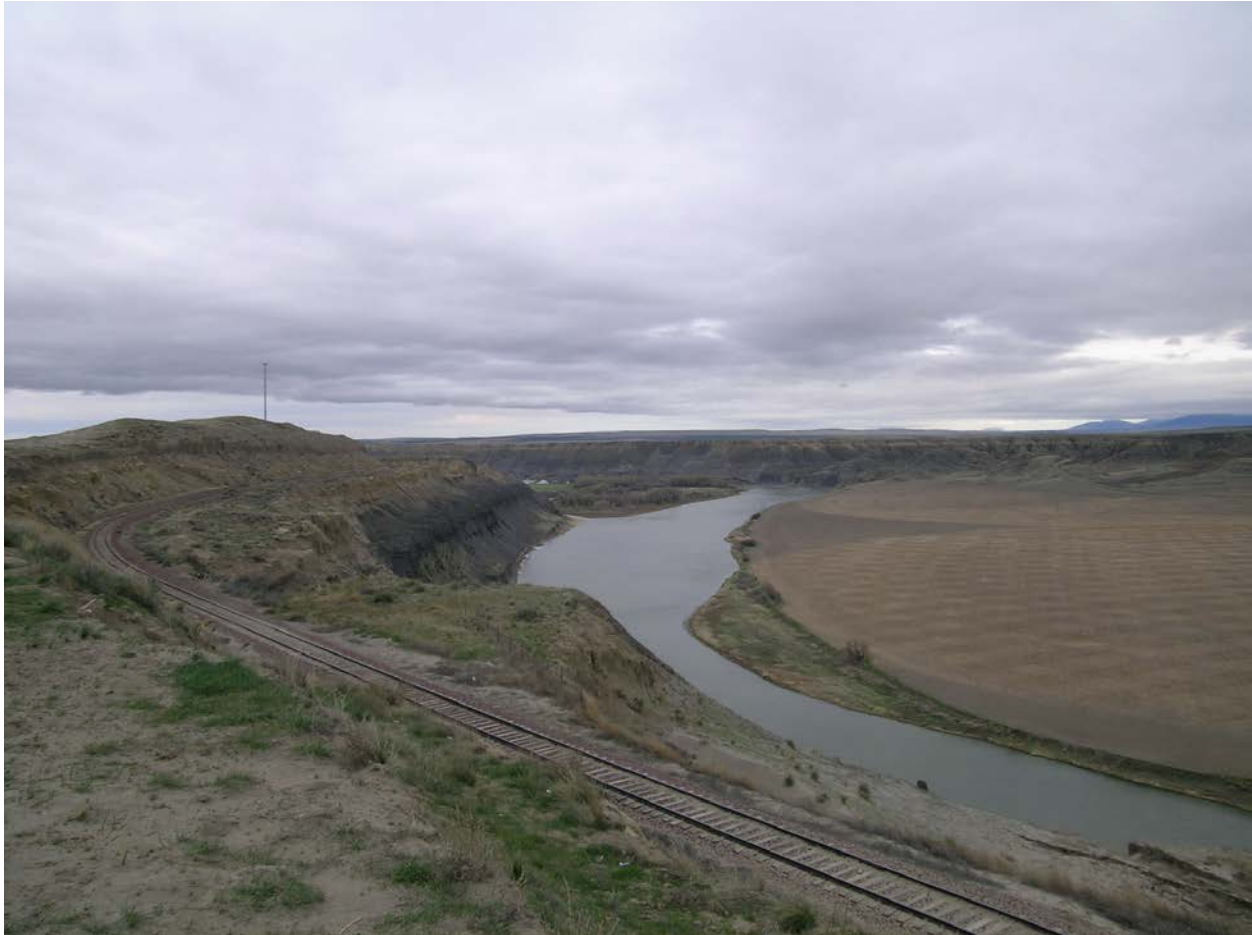
Figure 50.1. Flat planation surface east of Fort Benton showing Missouri River and the railroad tracks that Davis worked on.

Although Davis constantly acknowledged his debt to such predecessors as Powell, Jukes, Dutton and Gilbert, in later life he came to refer to his first notion of the cycle of erosion, while working on the Northern Pacific Railroad Survey in Montana in 1883, as rather like the blinding flash of understanding experienced by a prophet in the wilderness. 7