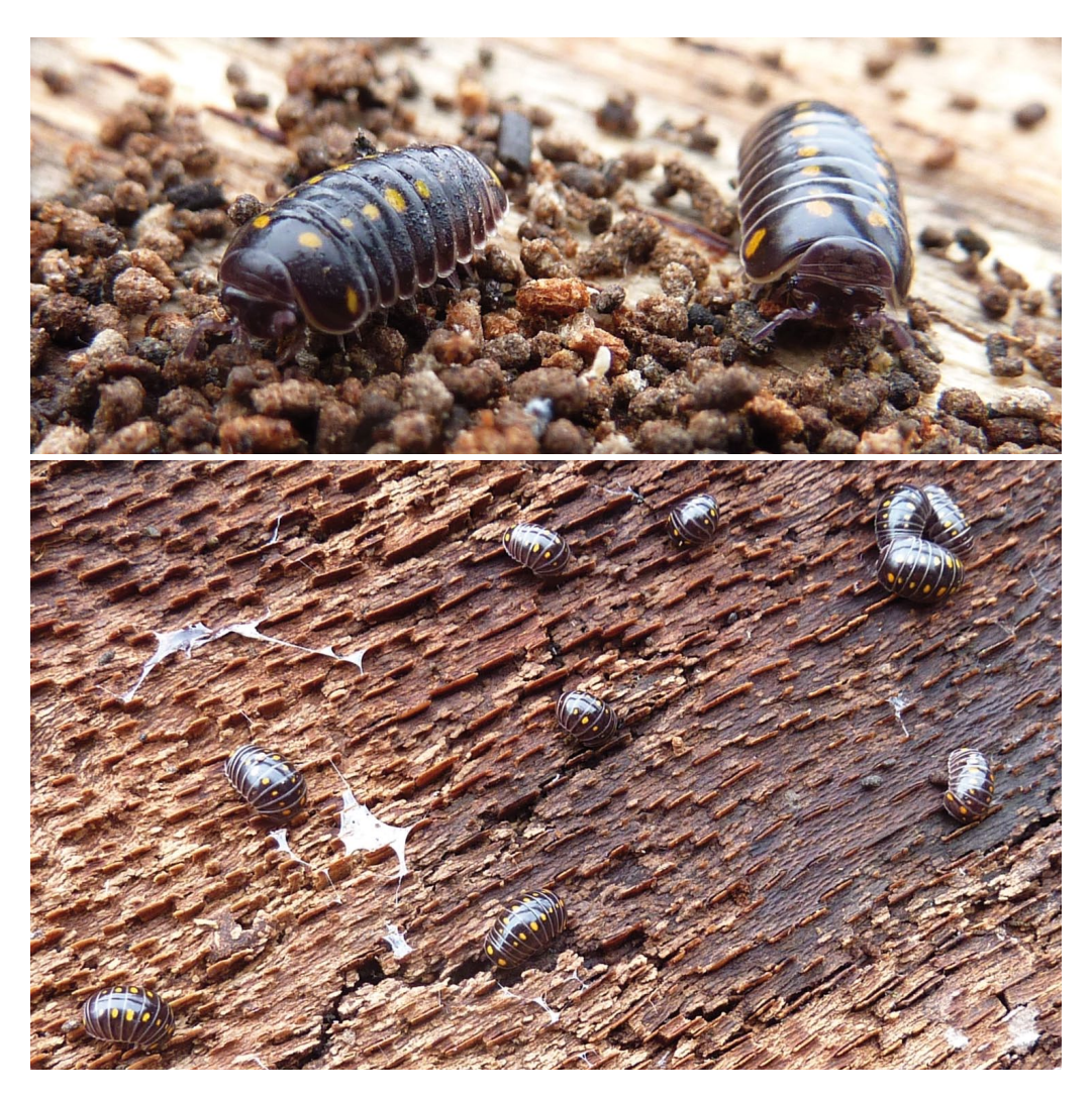
Fig. 1. The pill millipede, Glomeris pustulata Fabricius, 1781, is frequently found occurring at high densities under bark of fallen beeches: (above) pill millipedes eating faecal pellets of other phloem decomposers, (below) millipedes are abundant in their typical microhabitats.

Pill millipedes Glomeris pustulata Fabricius, 1781 (Fig. 1a) were collected in April 2011, during an excursion to Hůrka u Hranic National Nature Reserve in Moravia, the Czech Republic. Local forests were damaged by a windstorm in summer 2008 and several gaps were created. Pill millipedes are very abundant under the bark of fallen beech trees in such