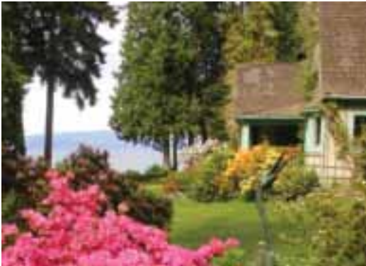
ABOVE: a view across the grand lawn from the ponds LEFT: R. 'May Day' blooms near the base of a 50 year old Metasequoia glyptostroboides ABOVE LEFT: R. augustinii frames the spectacular ocean and mountain views ABOVE RIGHT: The Milner House, built in 1930

Malaspina's goal is to maintain the garden and woodland in perpetuity for education and the community's benefit in the Milners' memory.