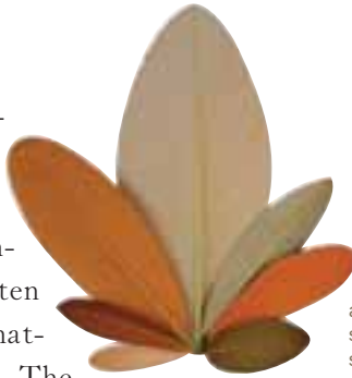
a comparison of leaf sizes, shapes and shades of indumentum

A species is a group of similar rhododendrons that grow naturally in the wild, in the same geographical location. Colourful, often fragrant flowers are pollinated by insects and birds. The resulting seed produces offspring that is identical to the parent. The leaves of different species can vary