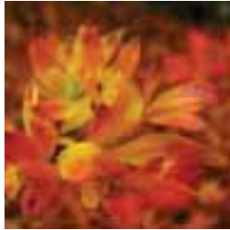
LEFT: Autumn leaf colour BELOW: a bank of multi-hued deciduous azaleas frames the Milner house

Deciduous azaleas lose their leaves in the winter, but not before a dramatic display of fall colour. These shrubs are generally more resistant to cold temperatures than the evergreen varieties. Deciduous azalea flowers are unique in their colour range, displaying shades of orange and coral not seen in other rhododendrons. Many are highly fragrant.