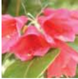
R. 'Lady Rosebery', a waxy petalled elepidote

When two different rhododendrons are successfully crossed a hybrid is produced. While this occurs naturally, many hybrids are created when humans cross-pollinate by hand. Crosses can be made of species or other hybrids, hopefully resulting in a plant that displays the best features of its parents. There are about 25,000 hybrids registered today, and counting!