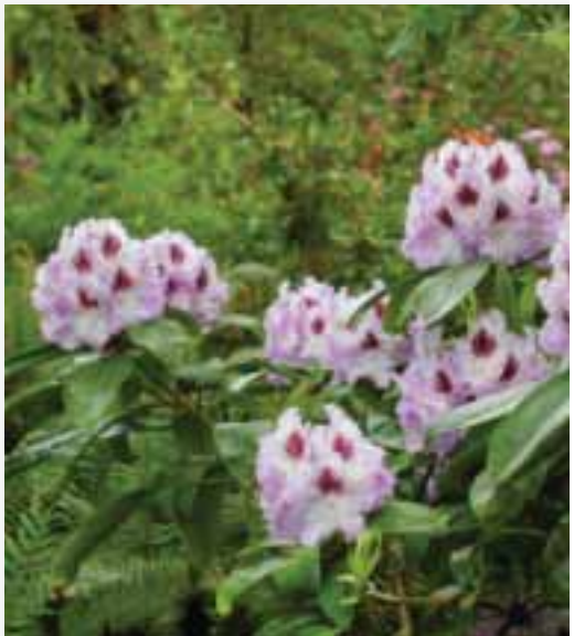
ABOVE: R. 'The Honourable Jean Marie de Montague' compliments the red blotch of R. 'C.J.S.' BELOW LEFT: R. 'Nancy Evans' BELOW RIGHT: R. 'Blue Peter'