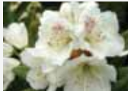
ABOVE: R. wallichii ABOVE LEFT: R. racemosum ABOVE RIGHT: R. aberconwayi RIGHT: R. barbatum