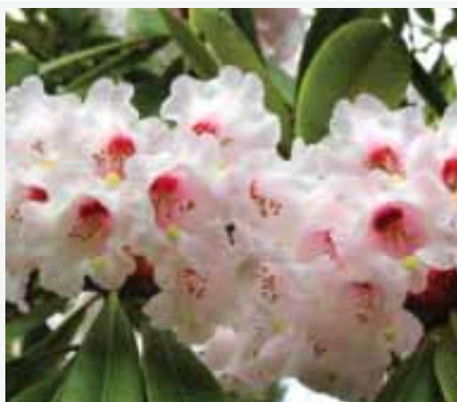
ABOVE: R. calophytum