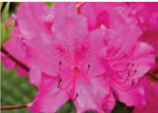
ABOVE: evergreen Japanese azalea RIGHT: an early 20th century bronze crane stands next to an evergreen azalea in full bloom FAR RIGHT: a double petalled evergreen variety exhibits multiple hues of pink on the same plant

Evergreen azaleas keep their small leaves through the winter. They are compact and low growing shrubs that can be grown in sun or part-shade. In spring they put on a spectacular show of dazzling blooms that shroud the plant in colour.