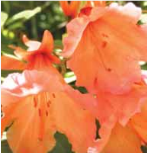
ABOVE: unnamed spinuliferum hybrid ABOVE CENTRE: R. 'Leda' ABOVE RIGHT: R. 'Purple Splendour' FAR RIGHT: R. 'Old Copper' RIGHT: R. 'Ruth Lyons'