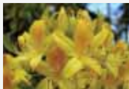
ABOVE: R. vaseyi or Pinkshell Azalea ABOVE LEFT: fragrant R. occidentale or Western Azalea MIDDLE LEFT: a double form of Exbury hybrid BELOW LEFT: highly fragrant R. luteum , latin for 'yellow' FAR LEFT: Mollis hybrid