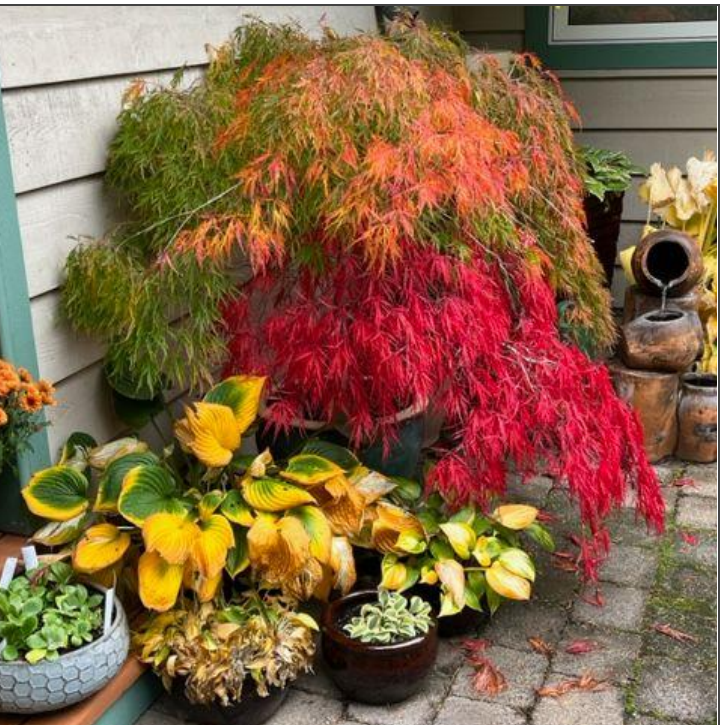
Acers and hostas

The RSBG continues to thrive because of its dedicated members, and we thank you for your continued support!