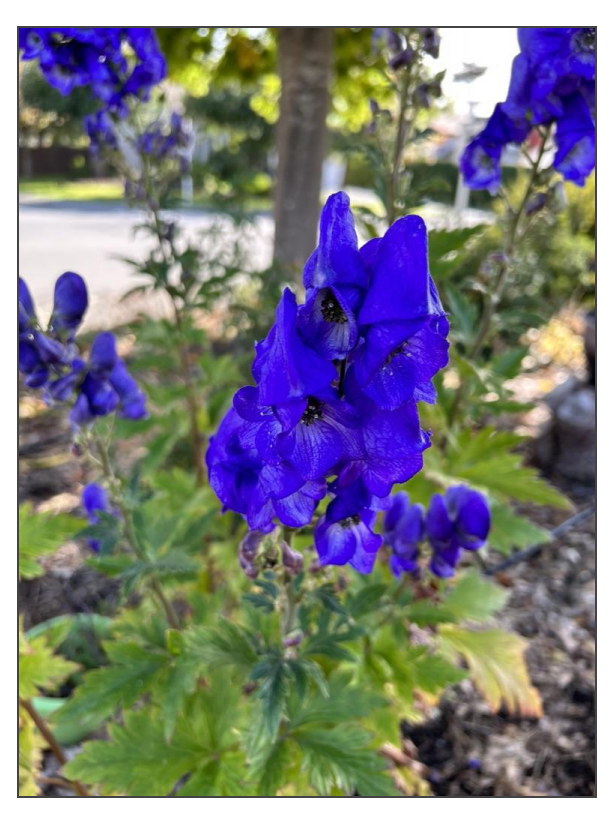
Monkshood and Asters