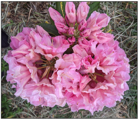
'Sooke Clouds' x neriflorum 'Rosevallon'

exchange bloomed at 3.5 years after sowing; the rest bloomed this following Spring. It holds exciting possibilities for small different plants as a parent. Rhododendron Species take up to 20 years, most hybrids take 4 or five years to bloom. They bloom faster in pots than in the ground. The second-year flower is a better qualifier of its potential. Growth habit, leaf structure, cultural stresses, root strength, ease of propagation and size are also important traits. Also, we must remember that most gardeners are not connoisseurs so the plant must be a good doer; we do not want to turn off the average gardener.