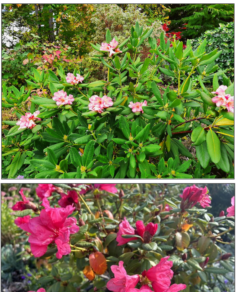
R. 'Whitneys Orange'