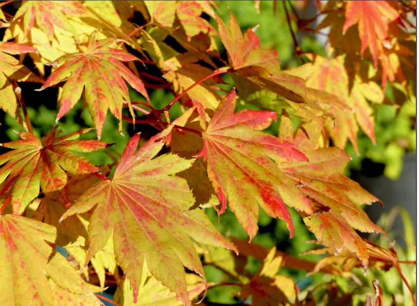
Acer shirasawanum 'Autumn Moon'

Cyclamen hederifolium