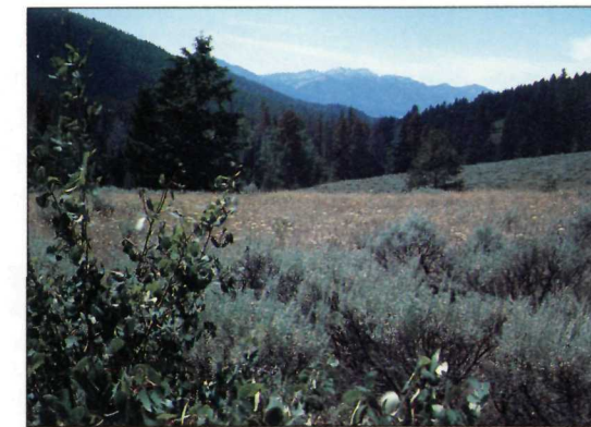
Mountainous terrain along the trail, Crandall Creek, Wyoming

General William Tecumseh Sherman called the saga of the Nez Perce "the most extraordinary of Indian wars." Precipitated into a fight they did not seek by the impulsive actions of the few revengeful young men, some 750 nontreaty Nez Percés — only 250 of them warriors, the rest women, children, and old or sick people, together with their 2,000 horses — fought defensively for their lives in some 20 battles and skirmishes against a total of more than 2,000 soldiers aided by numerous civilian volunteers and Indians of other tribes. Their route through four states, dictated by topography and their own skillful strategy, covered over 1,100 miles before they were trapped and surrendered at Montana's Bears Paw Mountains just short of the Canadian border and safety on October 5, 1877.