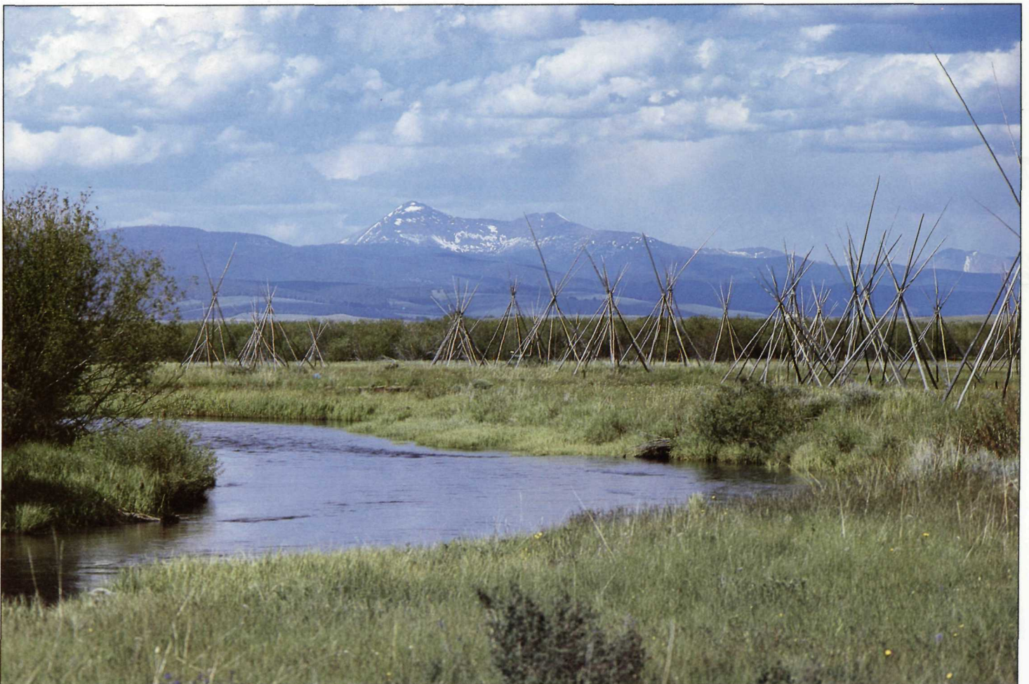
Nez Perce campsite, Big Hole National Battlefield, Montana