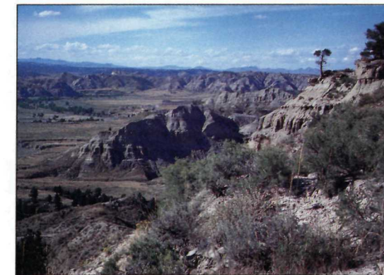
Steamboat Rock near Cow Island crossing of the Missouri River, Montana

There is irony in the tragic fate of the Nez Percés. In addition to having been loyal friends and allies of the whites for almost three quarters of a century, their conduct during the war was free of traits which whites usually associated with Indian warfare. Following what the whites regarded as a civilized code of conduct, the Nez Percés refrained from scalping, mutilating bodies, or torturing prisoners, and generally avoided attacks on noncombatant citizens. Nevertheless, as defeated Indians, the surviving Nez Percés were sent to several years of exile in present-day Oklahoma before they were allowed to return to reservations in the Northwest.