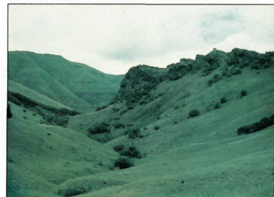
Whitebird Battlefield, Nez Perce National Historic Park, Idaho

In 1860, prospectors, encroaching on Nez Perce lands, struck gold. In the ensuing rush, thousands of miners, merchants, and settlers, disregarding Stevens's treaty, overran large parts of the reservation, appropriating the Indians' lands and livestock and heaping mistreatment and injustices on the Nez Percés. To cope with the crisis, the United States Government engaged the angered Nez Perce in new treaty talks that culminated in a large treaty council in 1863. Nearly all tribal bands were represented. When the Government tried to get some of the bands to cede all or most of their lands, they refused to do so and left the council. In their absence, other chiefs, without tribal authority to speak for the departed bands, did just that, ceding the lands of those who had left the council. Their act resulted in a division of the tribe. Those who had signed were praised by the whites as "treaty" Indians; those who did not sign became known as the "nontreaty" Nez Perce.