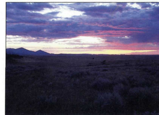
Dusk settles over the Montana prairie near trail's end.

There is irony in the tragic fate of the Nez Percés. In addition to having been loyal friends and allies of the whites for almost three quarters of a century, their conduct during the war was free of traits which whites usually associated with Indian warfare. Following what the whites regarded as a civilized code of conduct, the Nez Percés refrained from scalping, mutilating bodies, or torturing prisoners, and generally avoided attacks on noncombatant citizens. Nevertheless, as defeated Indians, the surviving Nez Percés were sent to several years of exile in present-day Oklahoma before they were allowed to return to reservations in the Northwest.