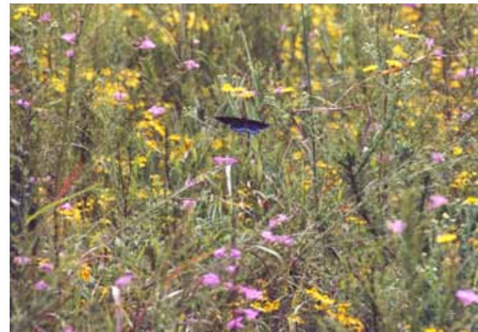
Red-spotted purple among summer wildflowers

Most butterflies have strong larval food plant preferences. Some species feed on just one species of plant. More often, a species’ caterpillars will eat a few closely related plant species and in some cases, large taxonomic groups of butterflies feed almost exclusively on a single plant family. A small proportion of butterflies will eat a broad range of plants from unrelated families. A dramatic example is the wide-ranging painted lady, for which more than 100 host plants from various families, including the asters, legumes, and mallows, have been recorded.