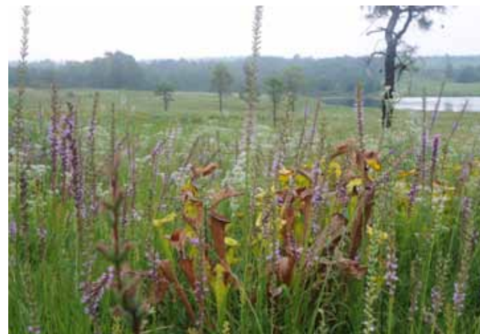
Oxpen seepage bog

Among the many rewards of studying butterflies is the opportunity to observe the direct ecological relationship between insect and plant. Butterflies, like many other insects, interact closely with plants throughout their life cycle, beginning with the adult female’s selection of a host plant on which to place her eggs. This is a crucial choice since the hungry caterpillars, upon hatching, will immediately begin devouring the food plant. This will continue until they are fully-grown and ready to pupate.