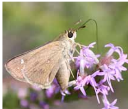
Dotted skipper

As with real estate, the key to finding butterflies is location, location, location! What type of habitat are you in and what time of year is it? To see a variety of butterflies, visit varied habitats in different parts of the state during the wildflower-growing season, typically April through October on the refuge.