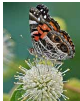
Painted lady on Buttonbush