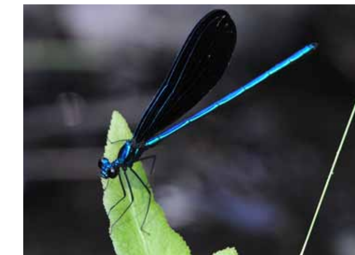
Ebony jewelwing