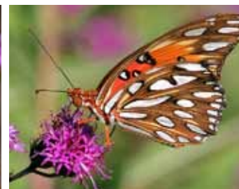
Gulf fritillary closed wing view