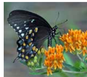
Spicebush swallowtail on Butterfly weed