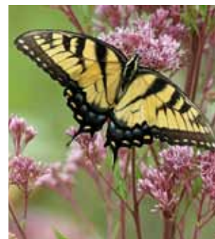
Tiger swallowtail on Joe-pye weed