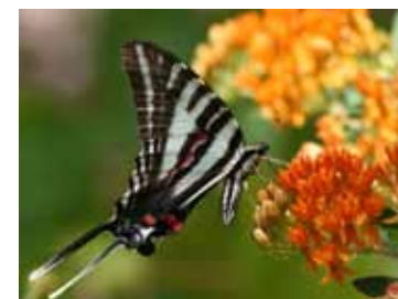
Zebra swallowtail on Butterfly weed