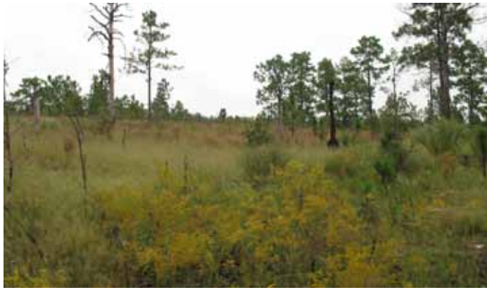
Longleaf pine ecosystem

The longleaf pine and wiregrass ecosystem is the characteristic habitat of Carolina Sandhills National Wildlife Refuge. Established in 1939, the refuge sits astride one of the most remarkable sections of longleaf pine range: the Sandhills. The uneven topography is responsible for a diverse group of plant communities that developed in the Sandhills. Botanists have identified more than 750 species of plants on the refuge, including plants from the Piedmont, Sandhills and Coastal Plain. None of this remarkable diversity would exist without certain natural processes that drive the entire longleaf pine ecosystem, the most important of which is fire.