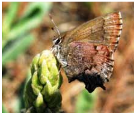
Frosted Elfin

In recent years, as numbers and species of pollinators worldwide declined, many scientists began to inventory and monitor these species as indicators of the overall health of ecosystems. On the refuge, scientists from universities, museums, and research agencies have developed lists of species, which previously had not been cataloged. For many species, this documentation represents a state record – the first time a species was recorded in the state. At the same time that scientists were beginning to look at pollinators, wildlife