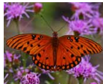
Gulf fritillary open wing view