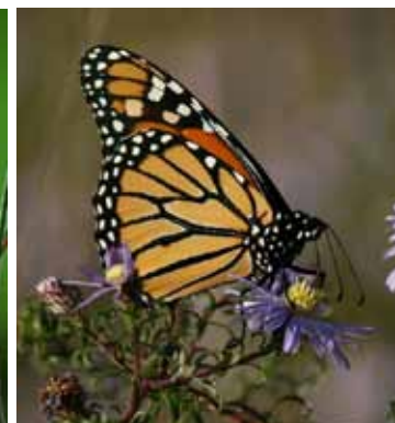
Monarch on Aster flower