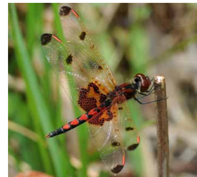
Calico pennant