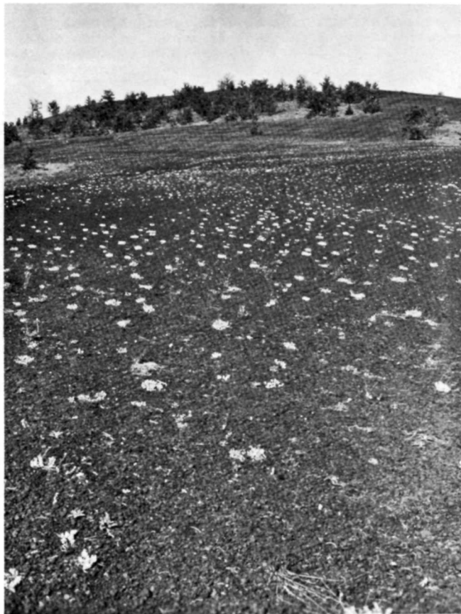
Figure 5. A typical cinder slope. The white plants are Eriogonum depressum .

where some soil and moisture are available. Scattered plants of Allium sp., E. umbellatum , Opuntia polyacantha , and O. rhodantha occur in the shallower cracks.