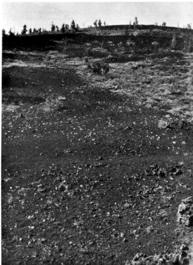
Figure 3. Station 5 located in island of vegetation on right on the east slope of North Crater.

Collection station 5 was located on the east side of North Crater cinder cone at an elevation of 5900 feet. It was set in a small island of vegetation dominated by P. tridentata and the herbs, C. douglasii and Phacelia leucophylla (Fig. 3). A bare cinder slope, much the same as described at station 8, surrounds this island of vegetation.