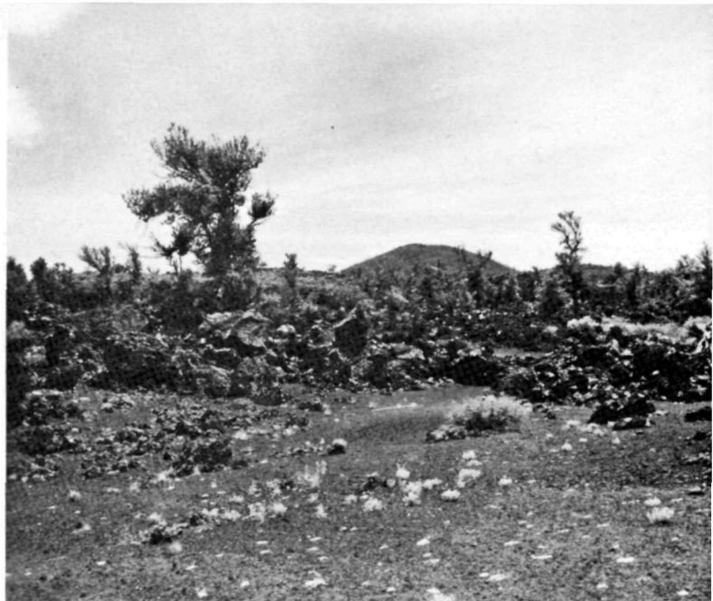
Figure 8. General features at the edge of an aa flow with cinder in the foreground. This is typical of the Devil's Orchard.

General area is a collective designation of convenience in the text for those few collection sites in lava habitats that could not easily be related to a landmark within the general study area.