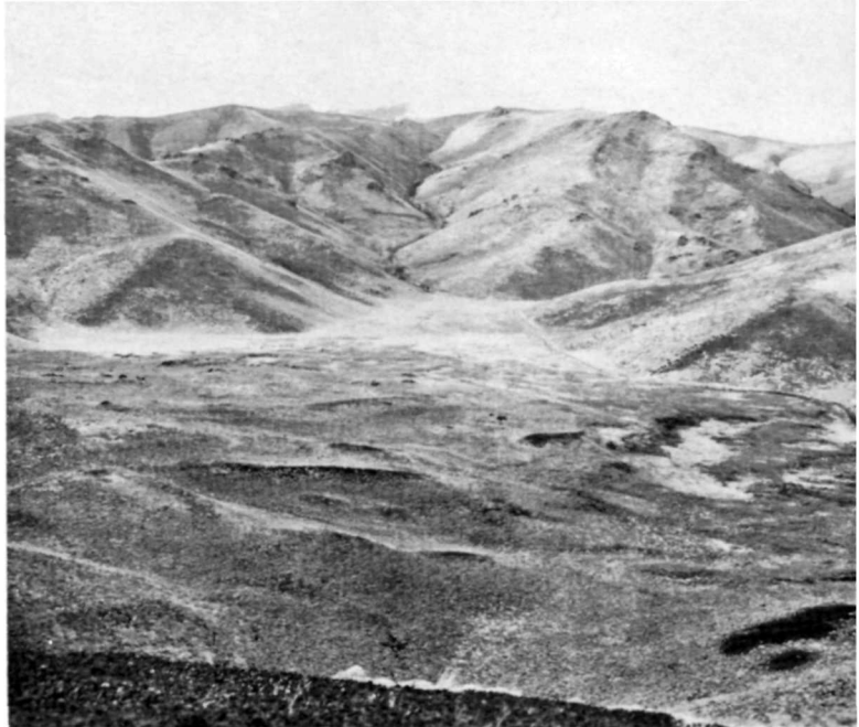
Figure 7. Aa lava flows northwest of Sunset Cone. Station 11 was located between the road and the irregular light area in the right of the photograph. The Pioneer Mountains are in the background.

more recent flow is made up principally of decomposed aa. Vegetation is noticeably different on the two flows. The decomposed aa flow supports scattered mixed stands of A. tridentata , P. tridentata , O. polyacantha and O. rhodantha as well as the herb species present on the older flow. In the loess and decomposing cinder area, the shrubs A. tridentata , C. millefolium , C. nauseosus , Crysothamnus viscidiflorus , and P. tridentata and the herbs Allium sp., Calochortus sp., E. ovalifolium , E. umbellatum , Mentzelia laevicaulis , P. leucophylla , Phlox sp., and Potentilla sp. are common.