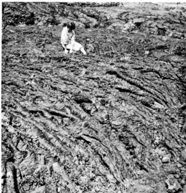
Figure 4. Ropy pahoehoe lava like that present at station 7. Small herbs can be seen in the cracks on the lava.

sp., Holodiscus discolor and Philadelphus lewisii are present. Herbs include C. douglasii , Erigeron spp., Eriogonum spp., P. leucophylla and Potentilla spp.