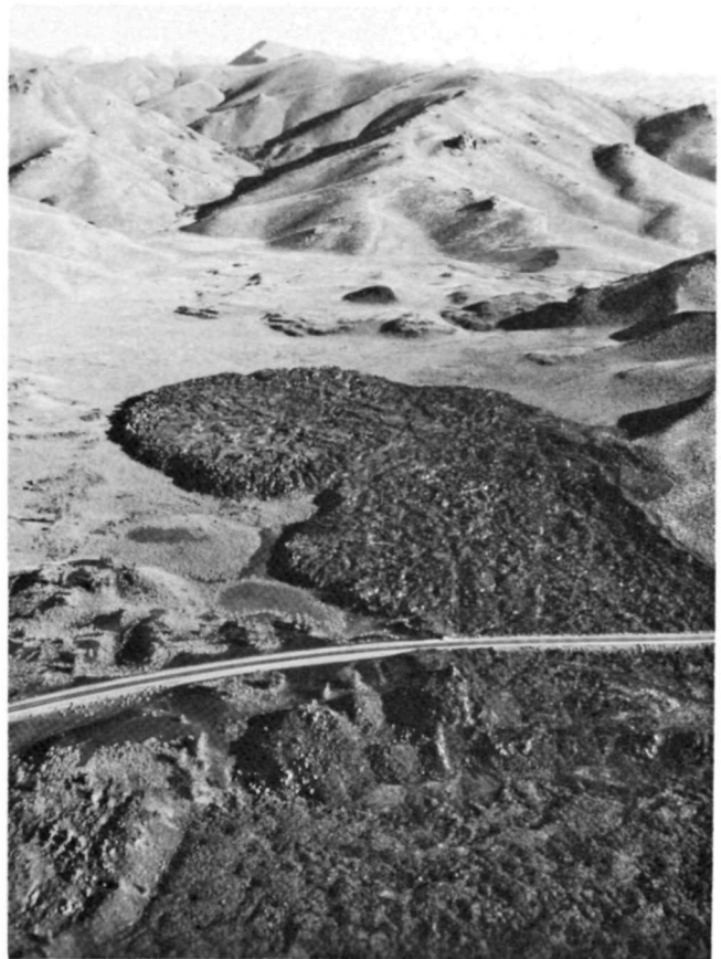
Figure 2. Highway Aa flow. Little Cottonwood Creek in background.

A great difference was noted in insect activity and abundance at this station in 1964 and 1965. In early June, 1965, a small corral was built at the bottom of the slope to keep horses. A continuous stream of running water was piped to the corral and the