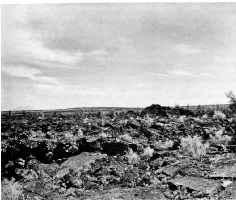
Figure 6. Lava formations typical of station 10.

Collection station 11 at an elevation of 5950 feet was on a treeless, exposed, decomposed and more recent aa flows that issued from the northwest side of Sunset Cone (Fig. 7). The soil on the oldest flow consists of loess and decomposing cinders while the