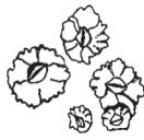
Rock Barnacle ( Balanus balanoides )