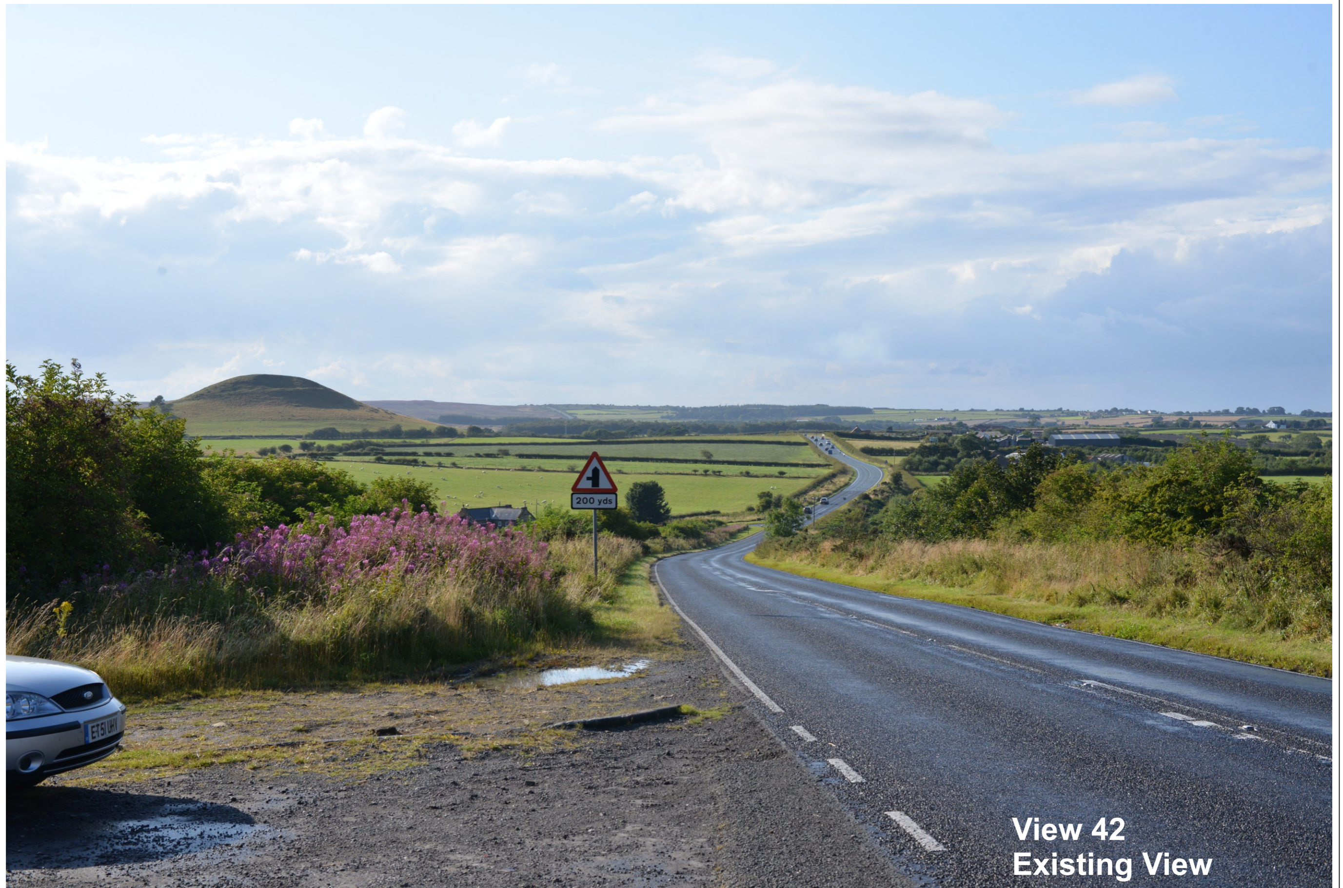
View 42 Existing View

Grid reference: E470221 N512088 Elevation: 219m AOD Direction of centre of view: 302° Horizontal field of view: 39.6° Distance to site boundary: 3212m